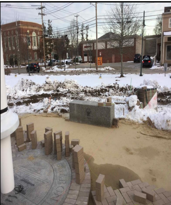
Sand and Paver Install