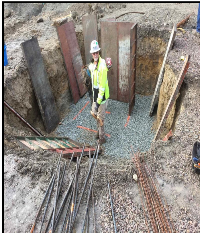
Form and rebar for Flagpole