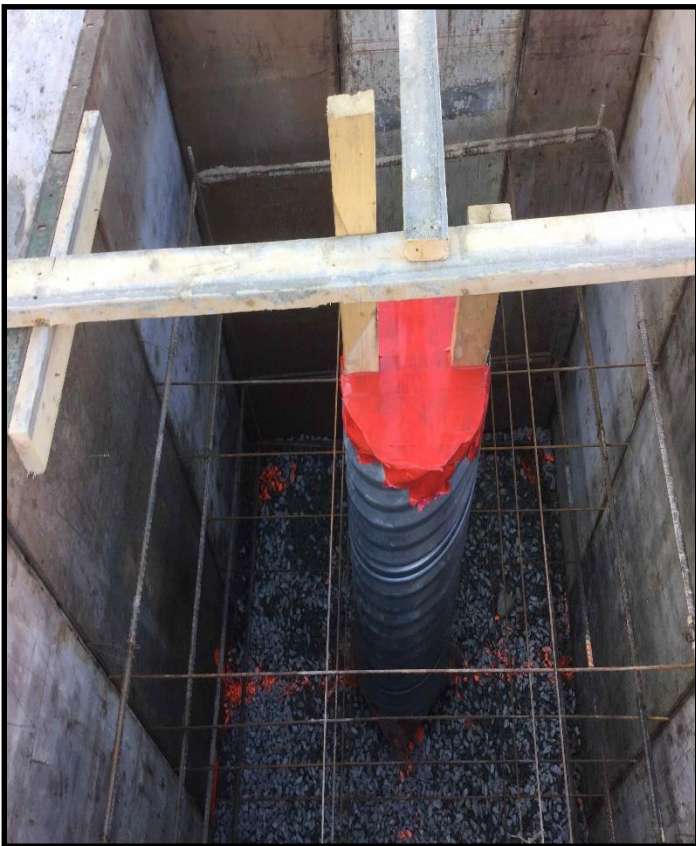
Set and Form Flagpole Sleeve