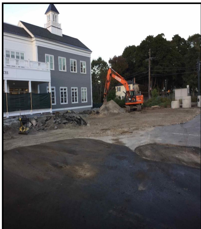
Excavate for Cut and Cap