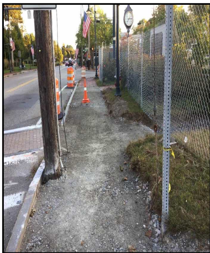
Main Street Sidewalk Prep