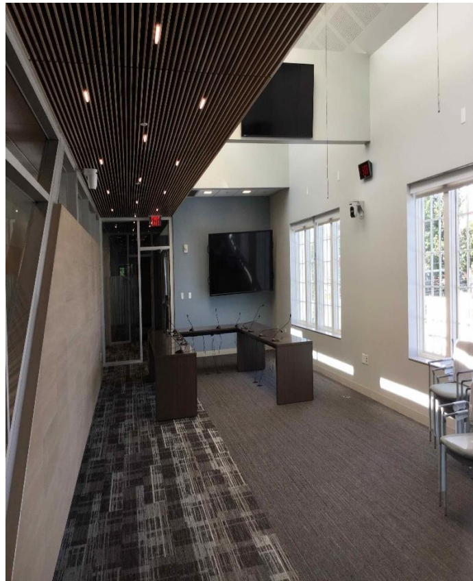
New meeting Room