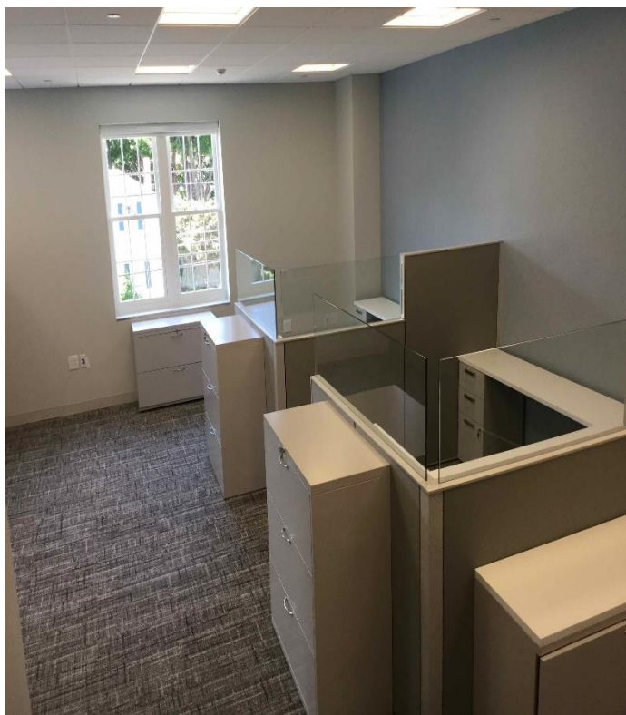
New Office Space