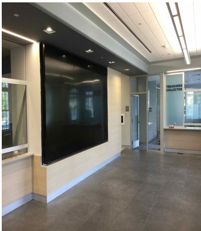
Town Hall Lobby