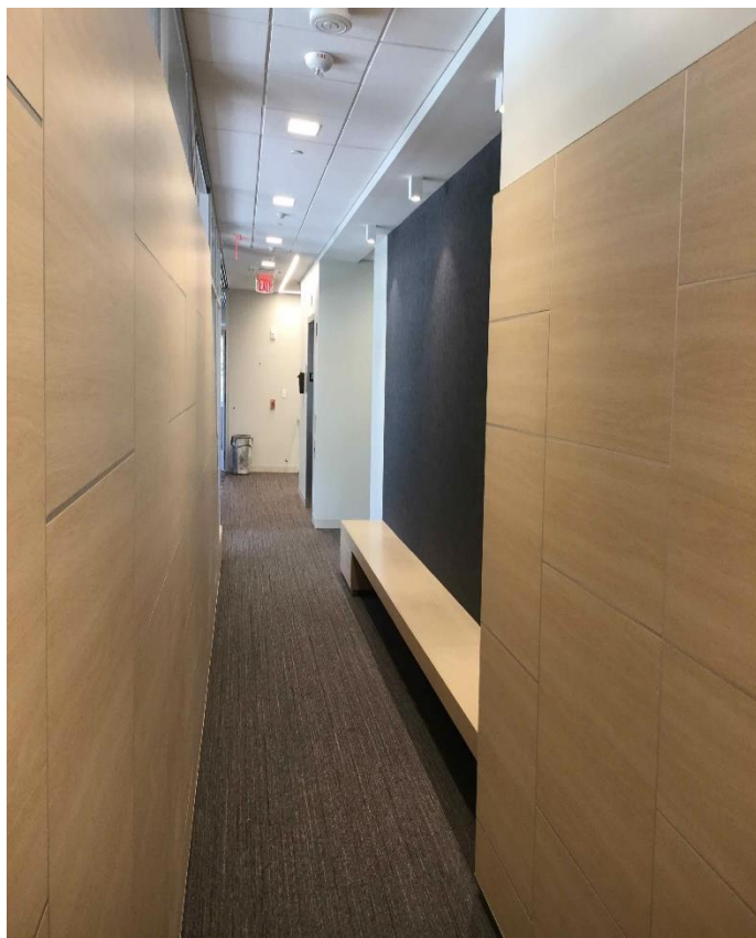
2 nd Floor Hall