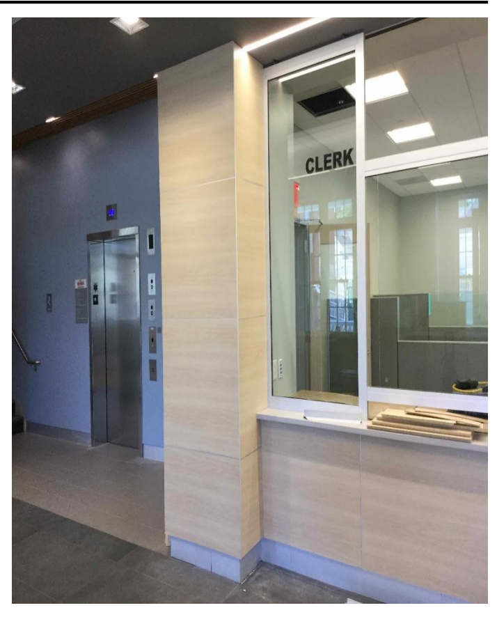
1<sup>st</sup> Floor Lobby