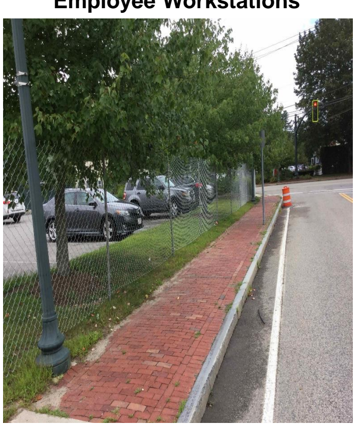
Phase 3 Fence Install