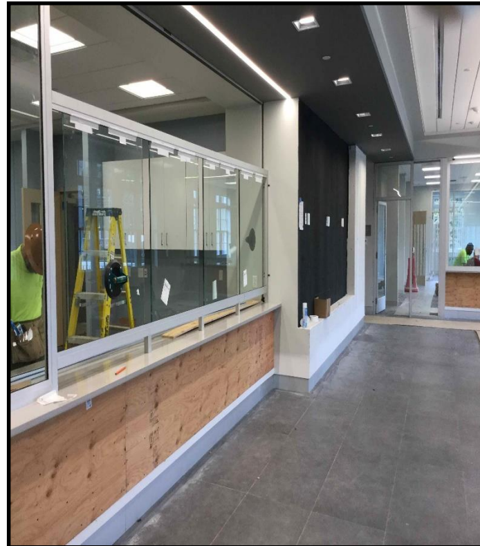
Transaction Frame / Glass