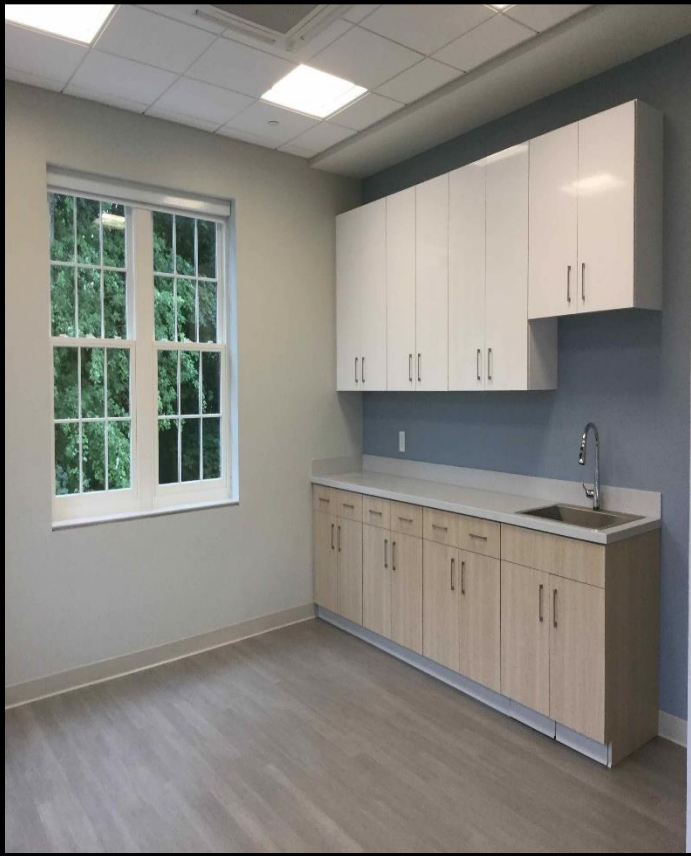
Staff Break Room