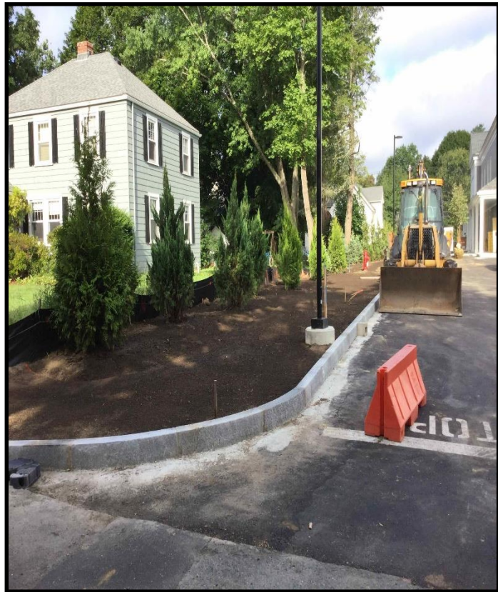
Bradford Ave. Entrance