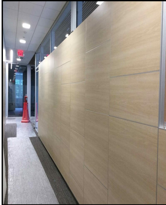
Meeting Room Wall Panels