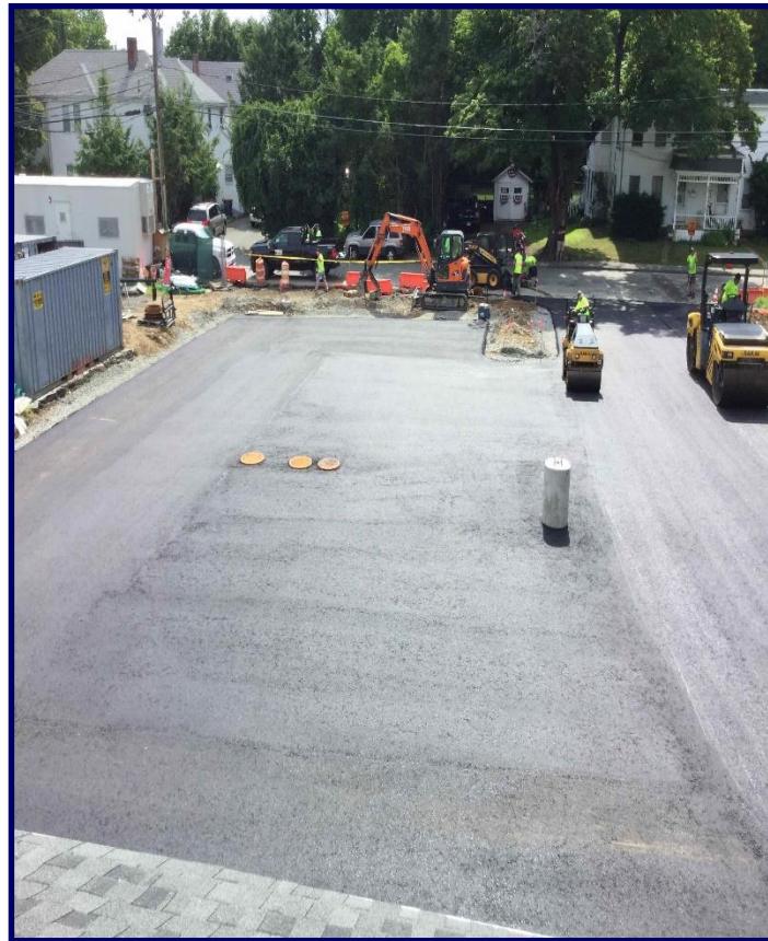
Parking Lot Asphalt Binder