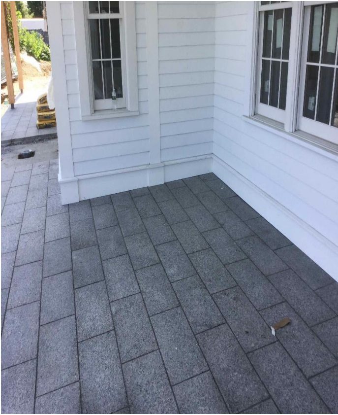
Porch Finish Trim