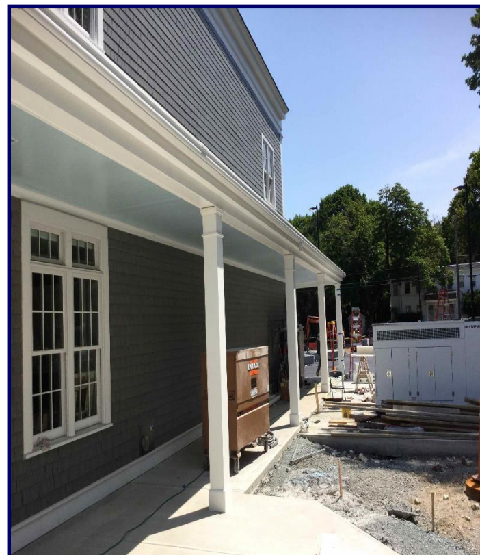
South Column Enclosures