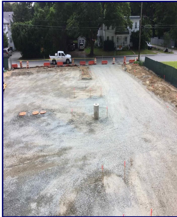
Parking Lot Subgrade