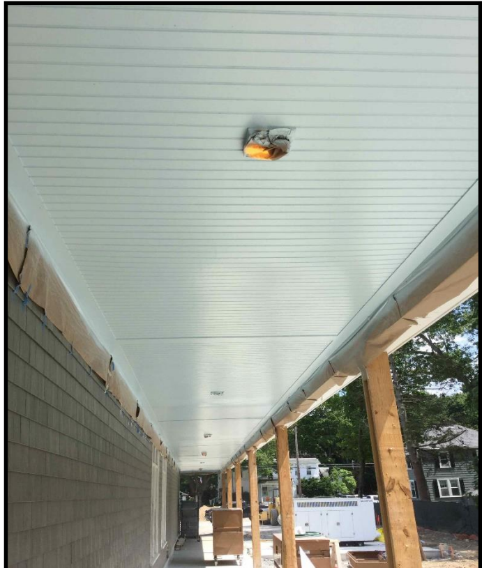
South Canopy Ceiling