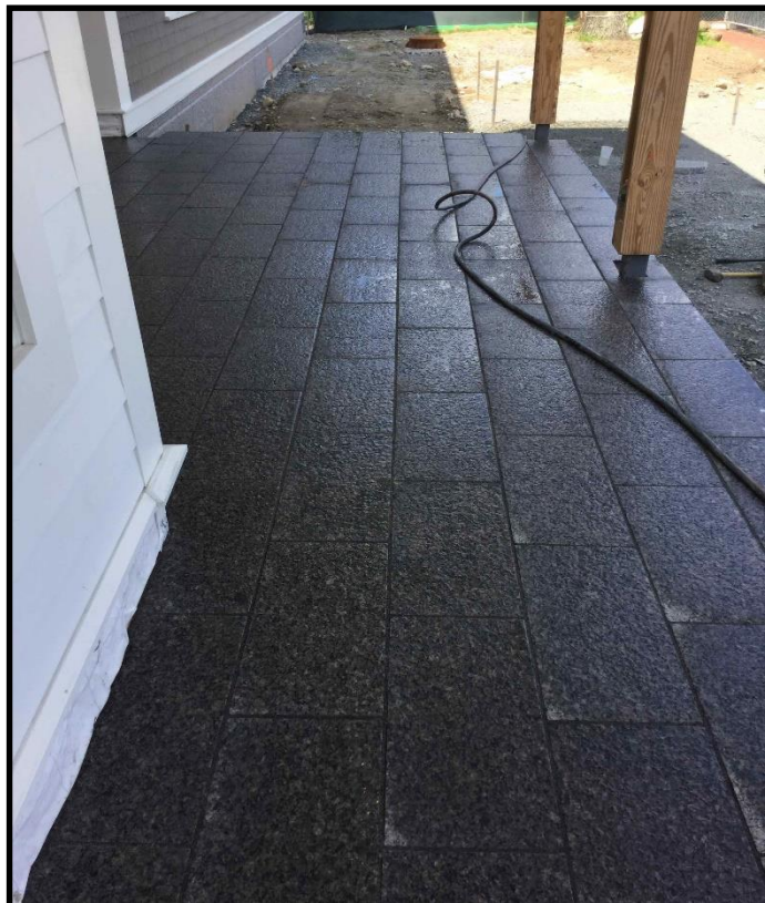
Granite Paver Install