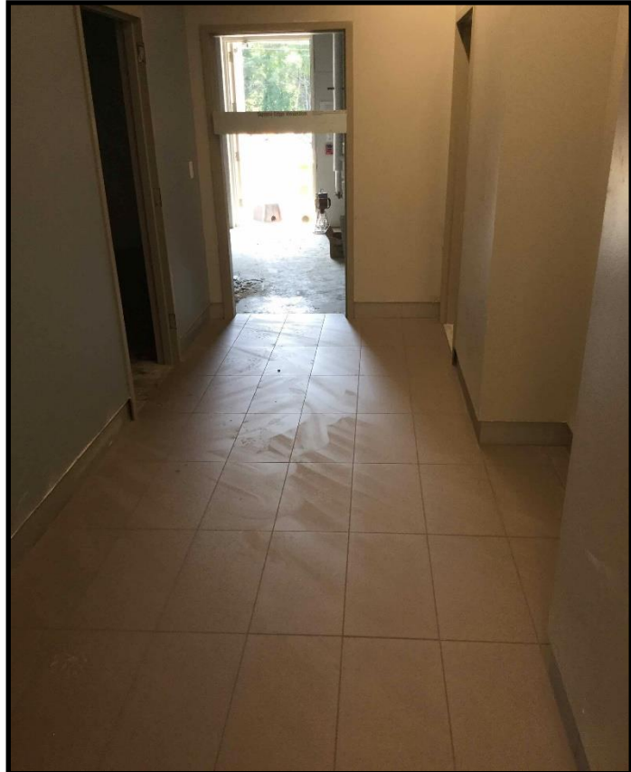
1 st Floor Hall Tile