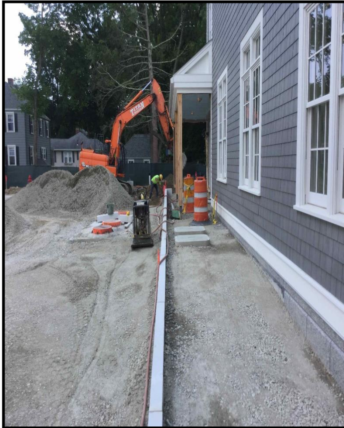
Install Granite Curbing