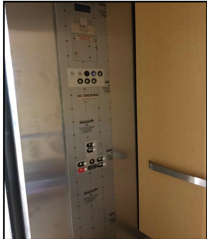
Elevator Cab Controls