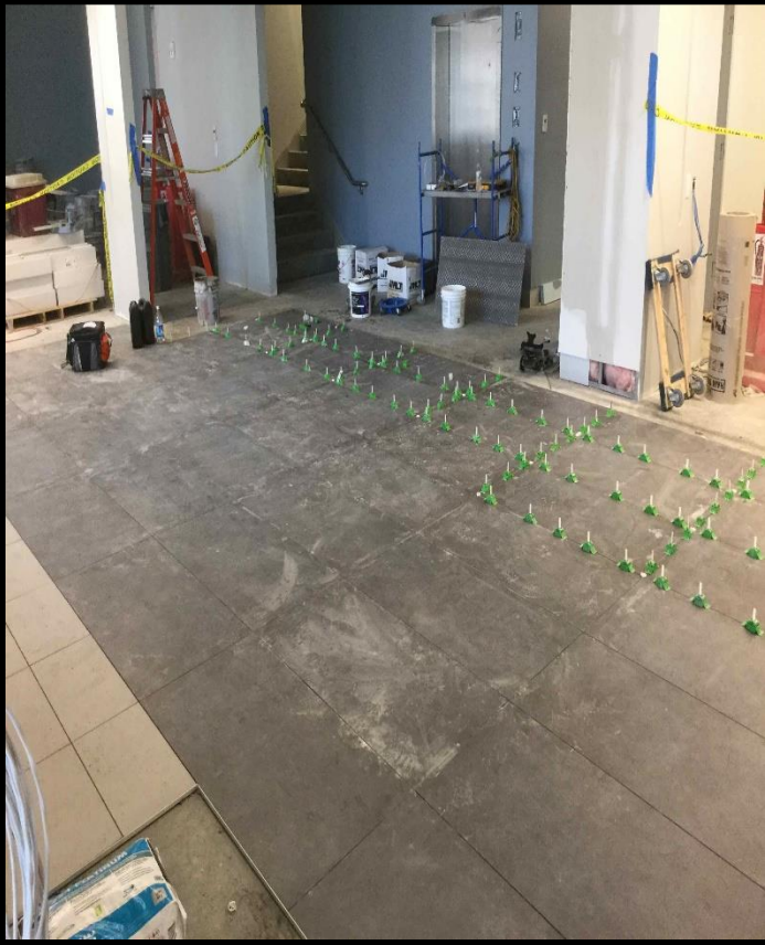
Floor Lobby Tile