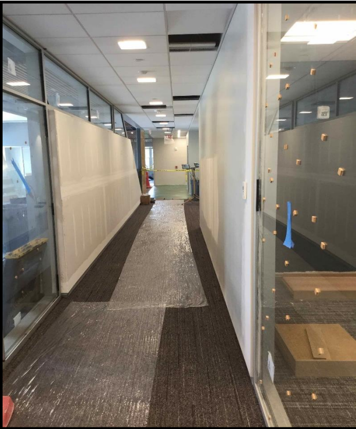
2 nd Floor Hallway