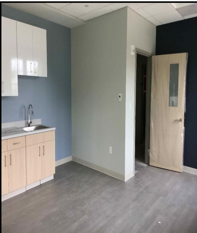
Staff Break Room