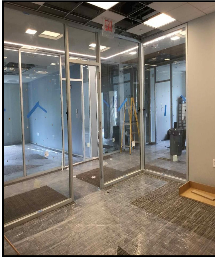
Aluminum Frame Installation