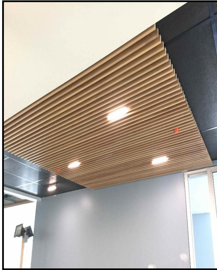
Wood Ceiling Installation