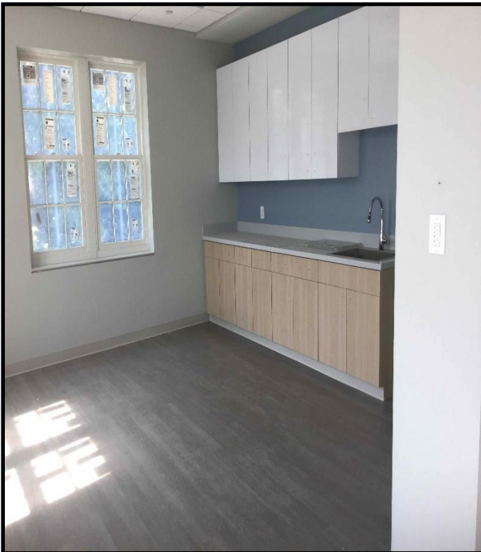
Staff Break Room