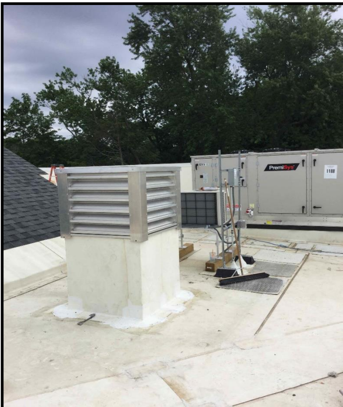
Elevator Exhaust Install