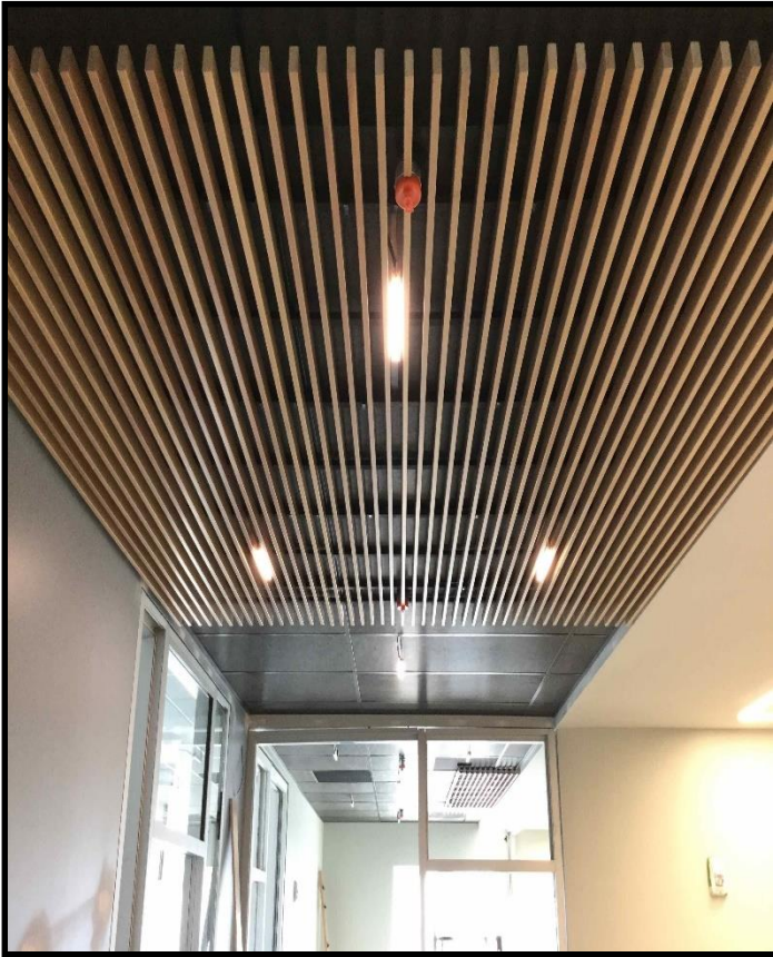
Wood Ceiling Installation