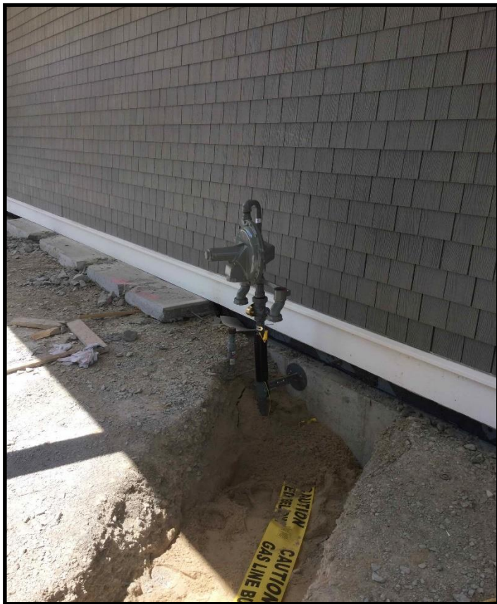
Underground Gas Service