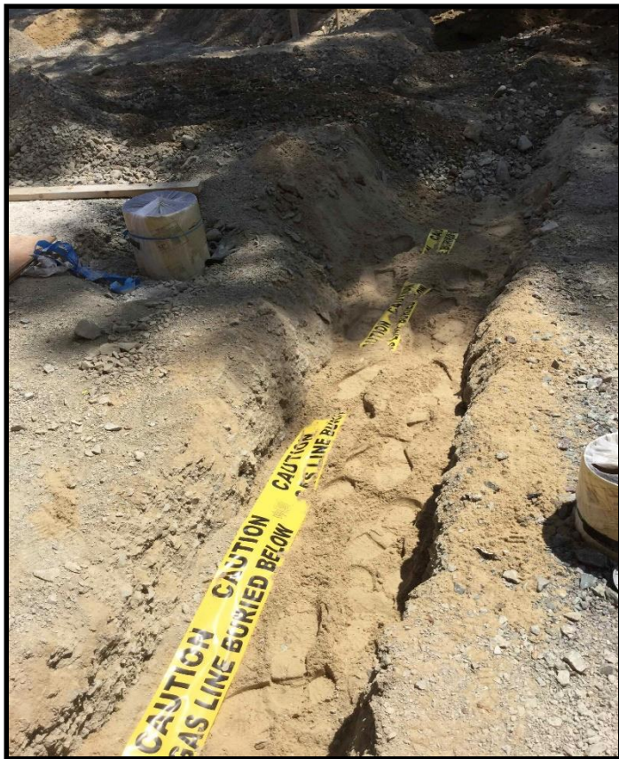
Gas Line Back Fill