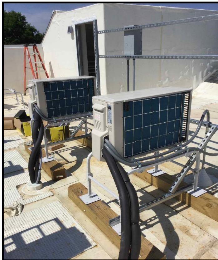
Roof AC Unit Connections