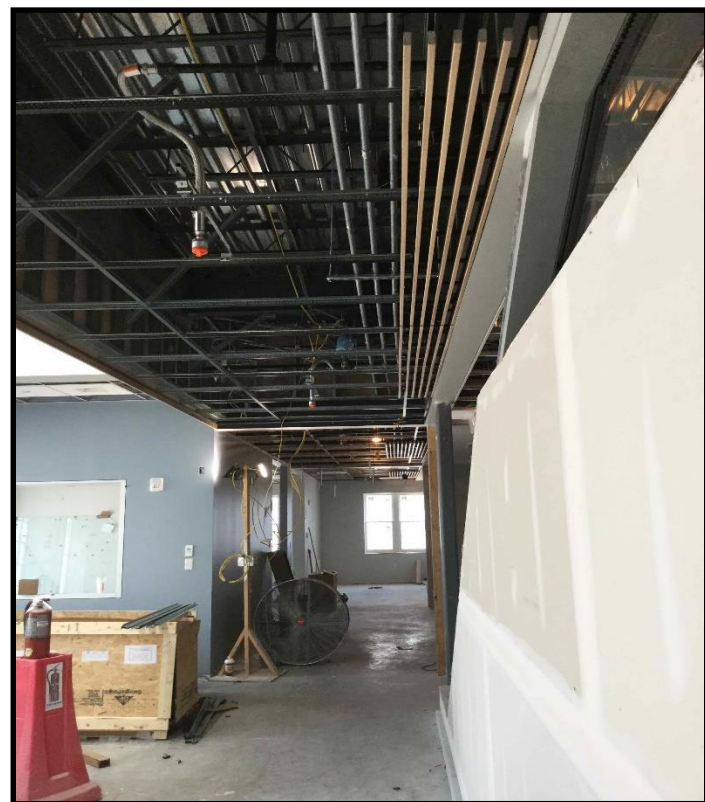
Wood Ceiling Installation