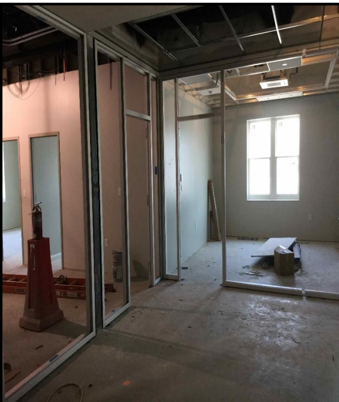
Aluminum Frame Installation