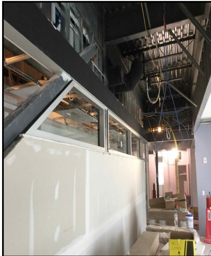
Meeting Room Glass