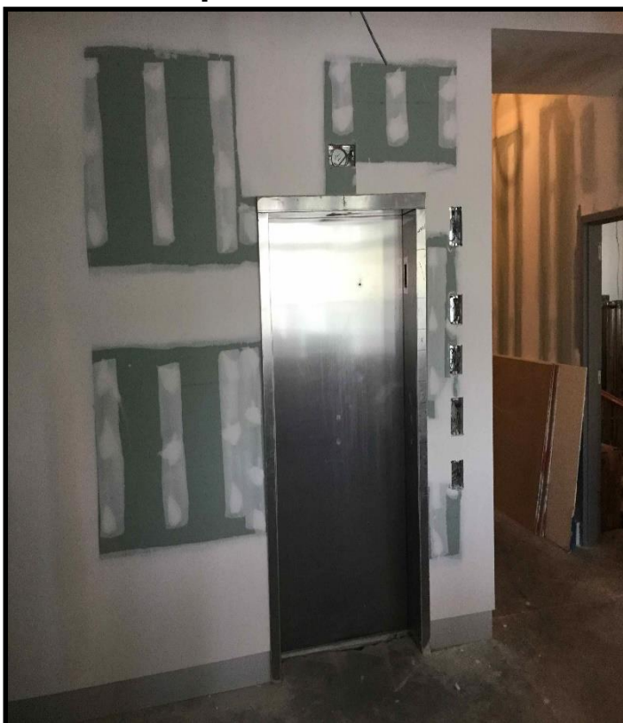
1st Floor Elevator Door