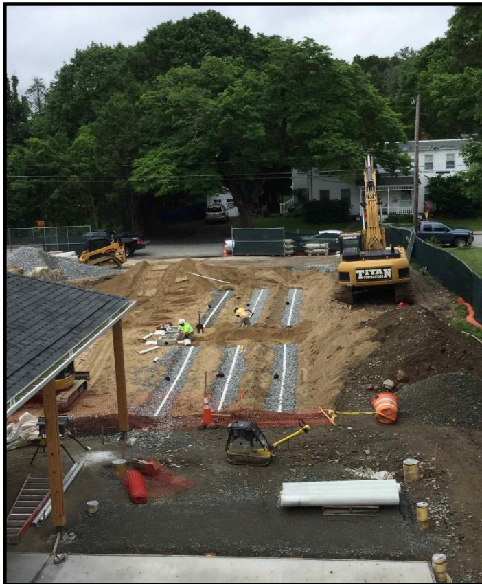
Septic Leech Field