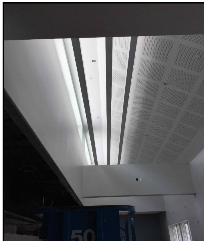
Meeting Room Lights