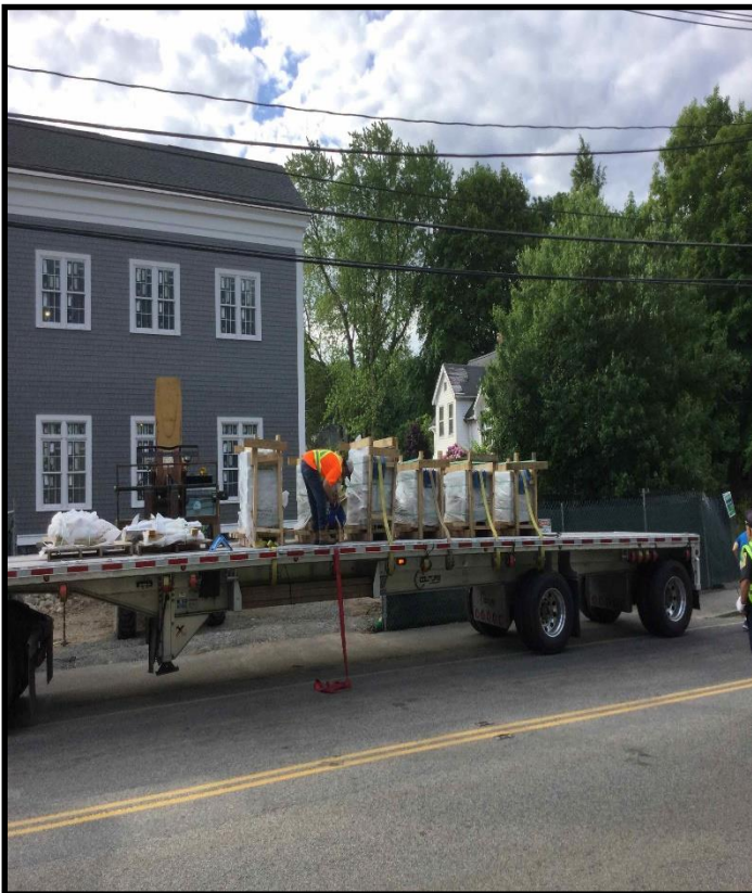
Exterior Granite Delivery