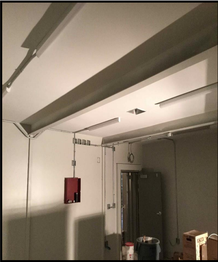
Fire Suppression Rough