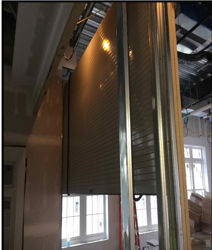
Coiling Door Installation