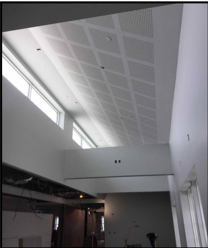
Meeting Room Finishes