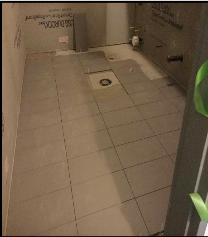
Floor Tile Installation