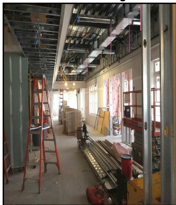
First Floor MEP Rough