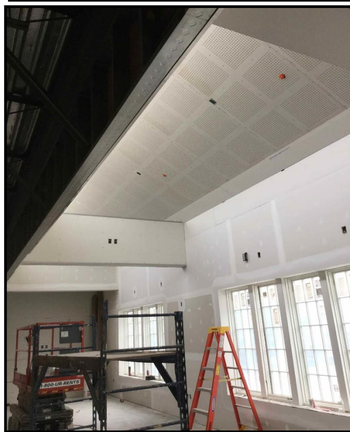
Second Floor Meeting Room