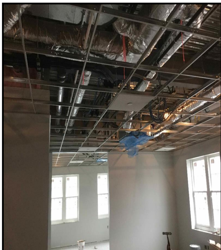
Ceiling Grid Installation