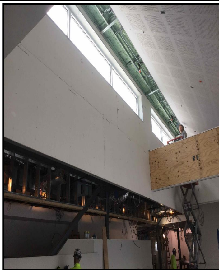
Second Floor Meeting Room