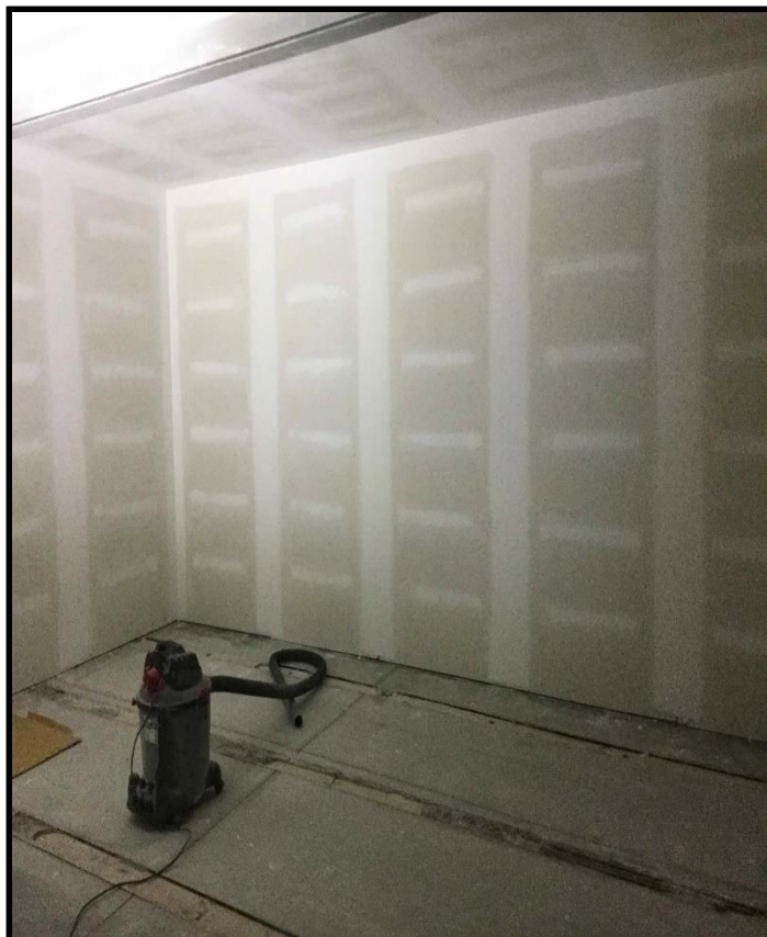
Vault Interior Walls