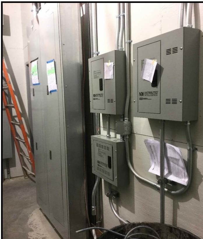
Main Electric Room Build out