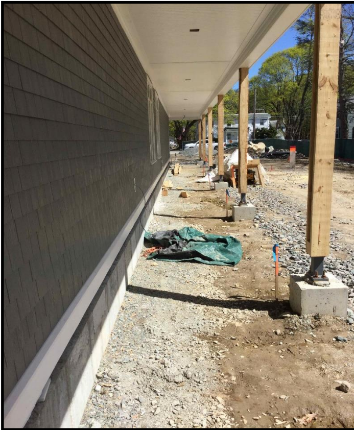
South Lower Canopy