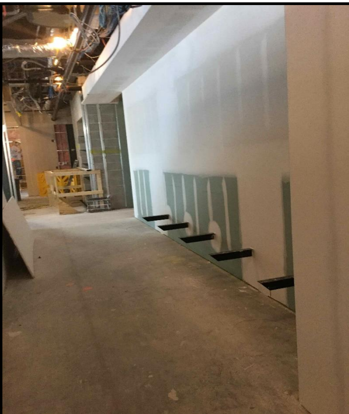
2 nd Floor Bench Area