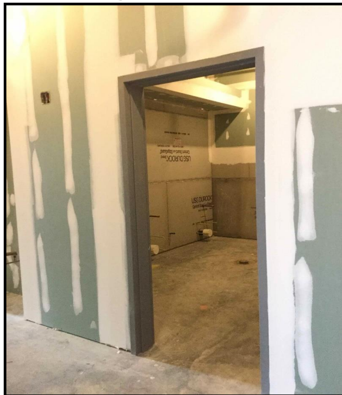
2 nd Floor Bathroom