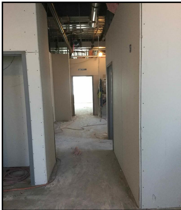
1 st Floor Drywall