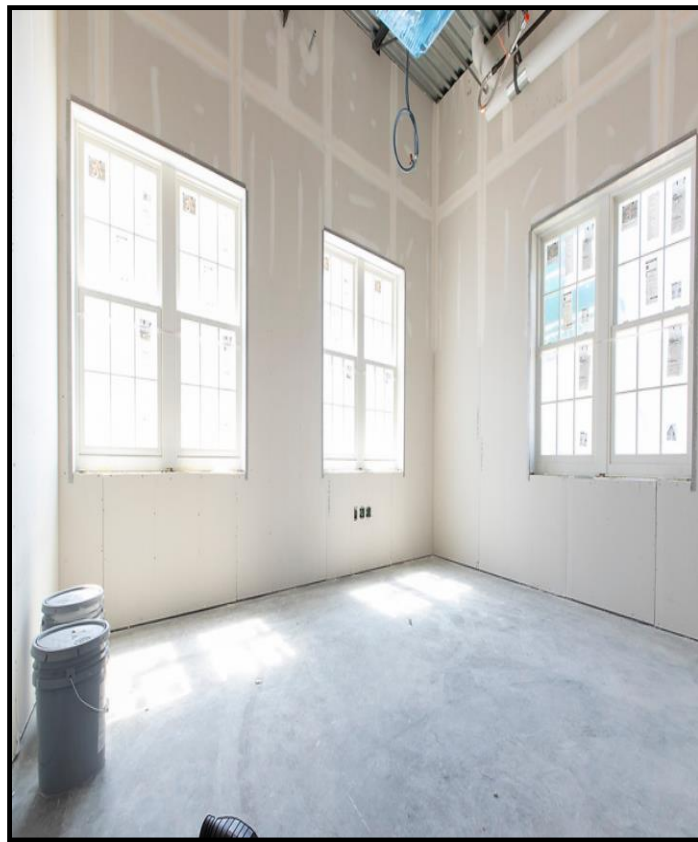
Mud/Tape 2 nd Floor