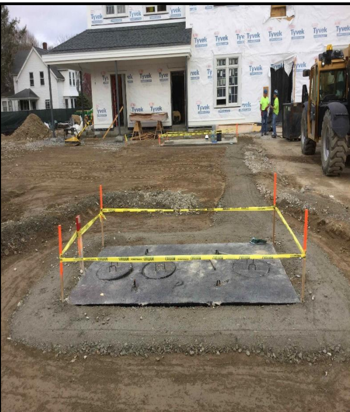
Septic Tank Backfill