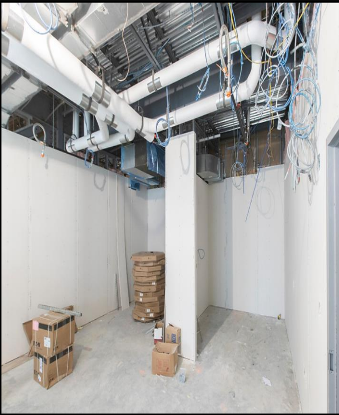
Drain Pipe Insulation