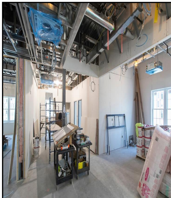
2 nd Floor Soffit Framing