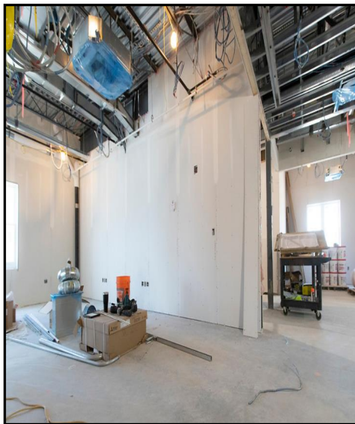
2 nd Floor Drywall