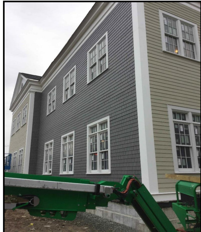
West Elevation Siding