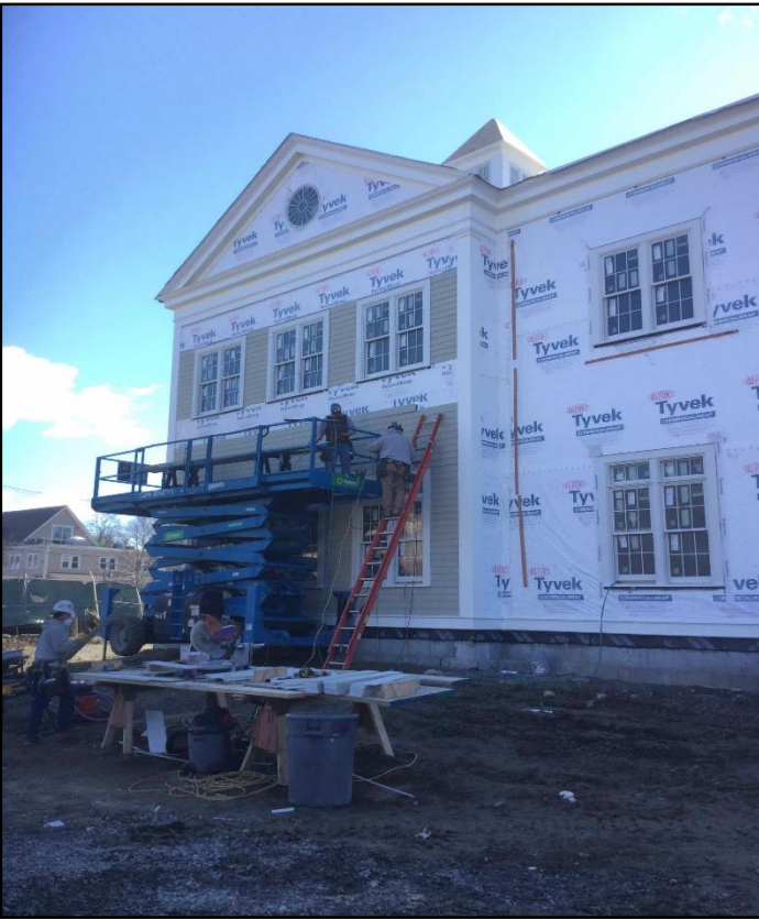
Lap Siding Installation