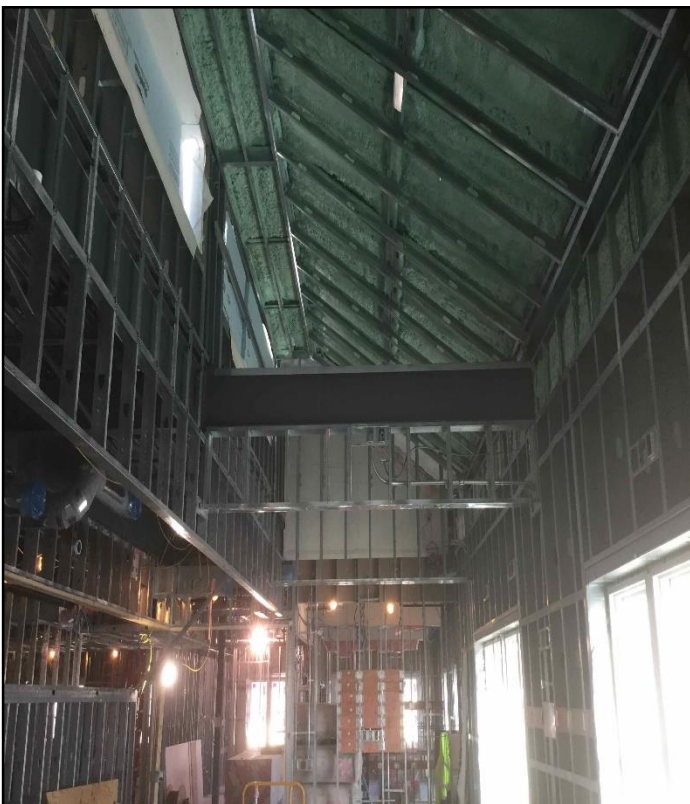
Meeting Room Rough