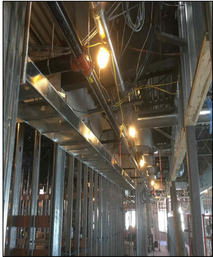
Sprinkler Main Install