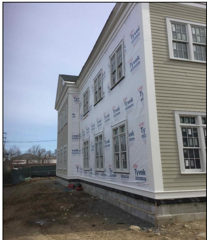
Lap Siding Insatallation