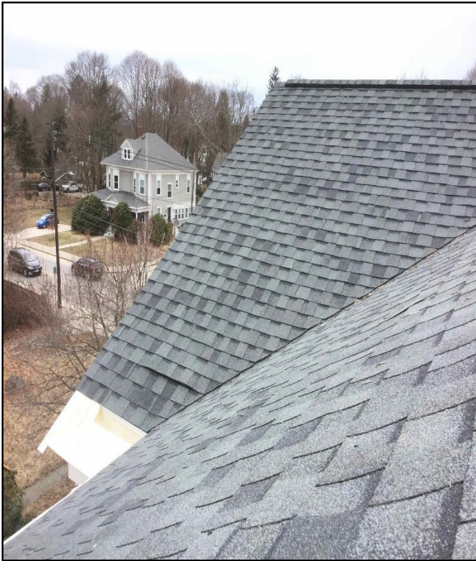
Shingle and Venting