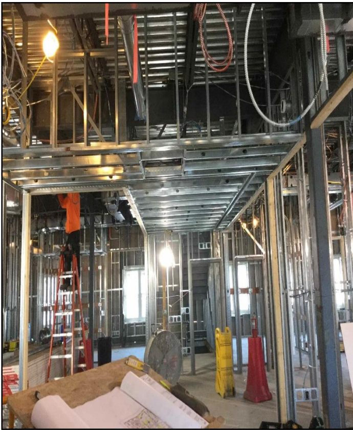
GWB Ceiling Framing