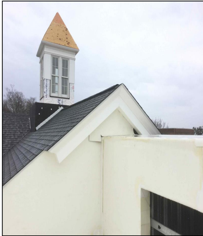
Cupola Trim Installation