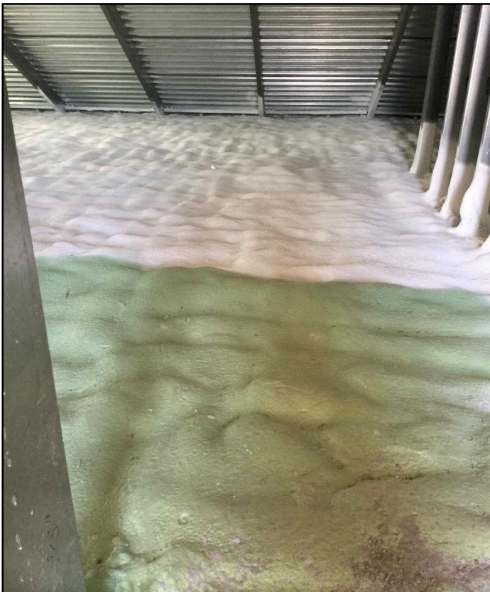
Attic Spray Foam Insulation