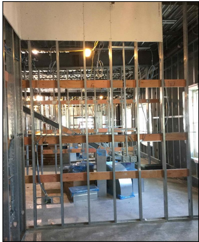
In Wall Blocking