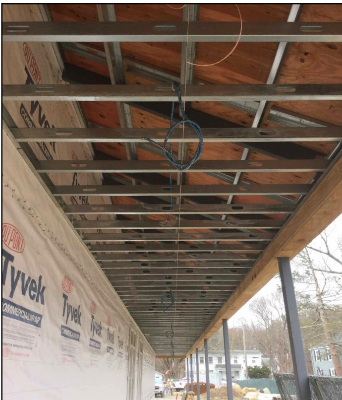
Exterior Ceiling Lights