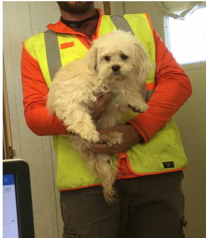
Dod Rescue and Return