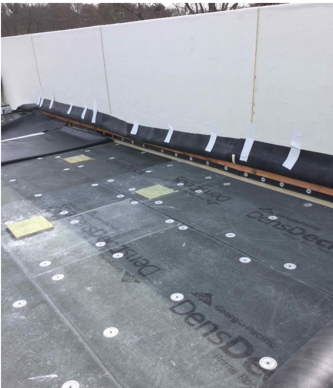
Protection Board Install