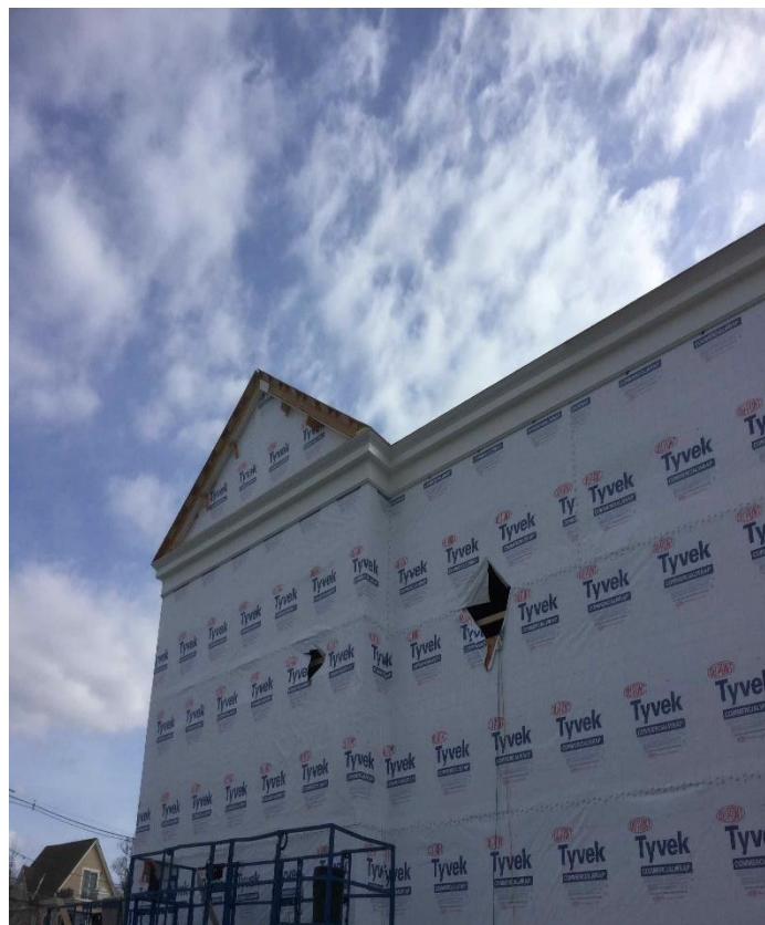
Trim Installation - North