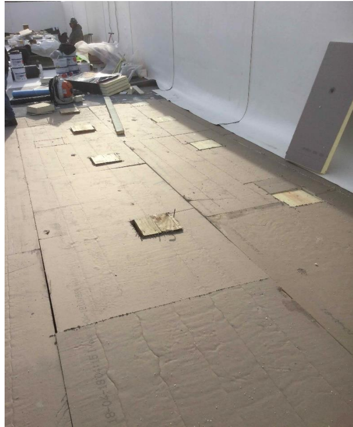
Roof Insulation Installation