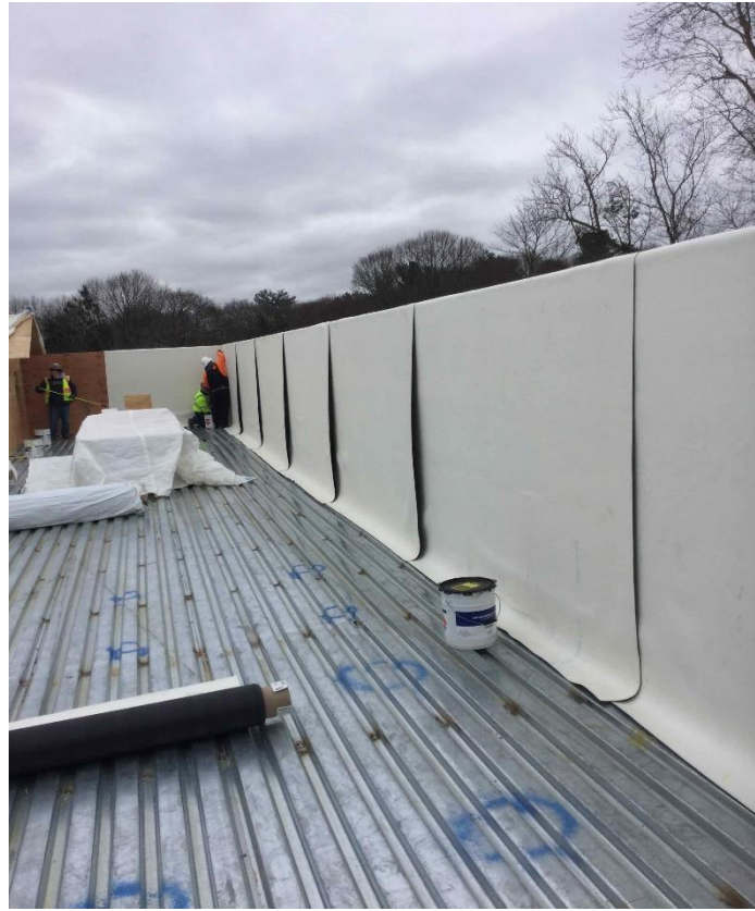
Parapet Wall Membrane