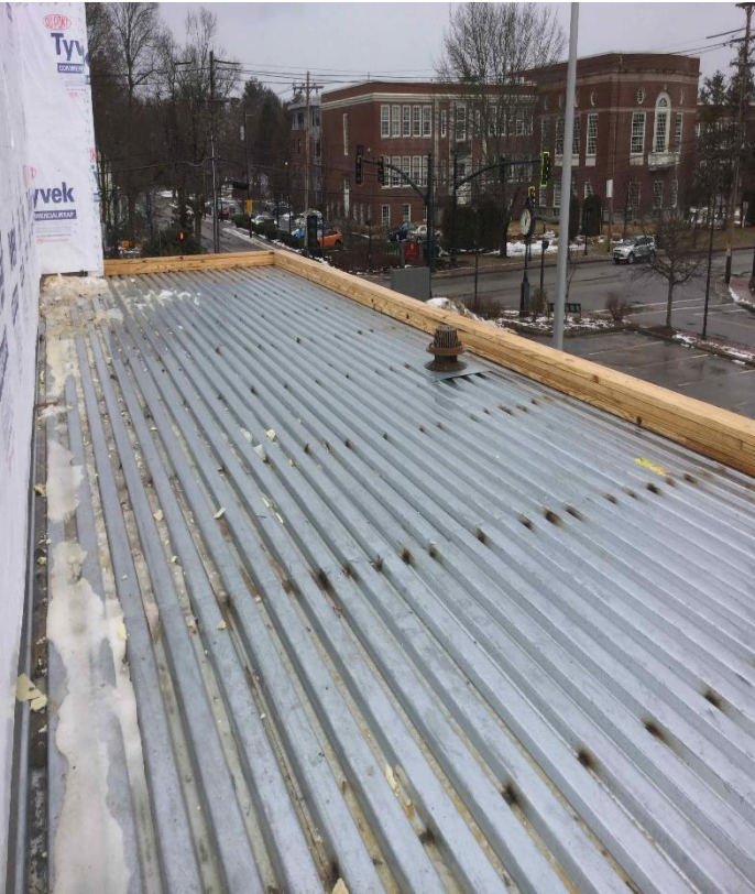
Low Roof Blocking