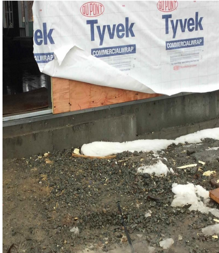
Angle Flashing Installation