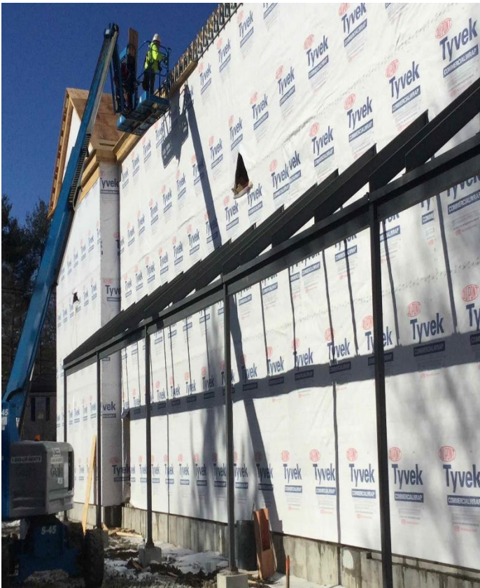
West Elevation Roof Framing