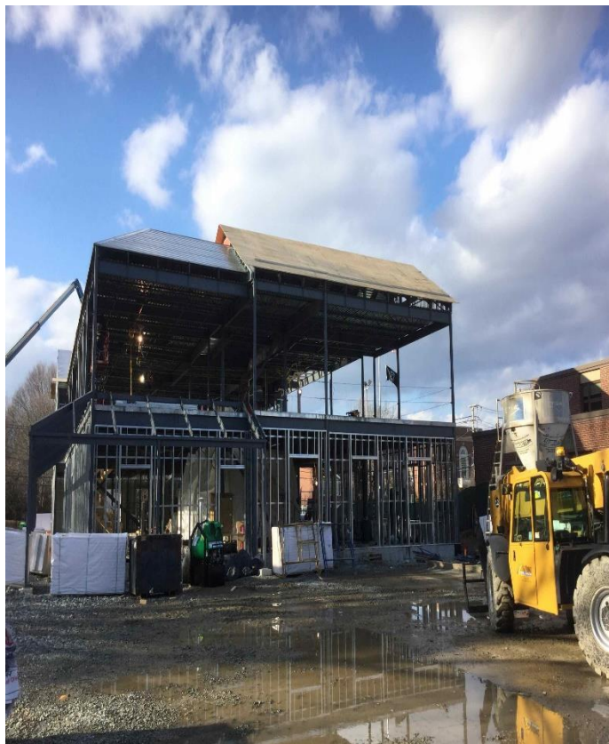
2 nd Floor Slab Finishing