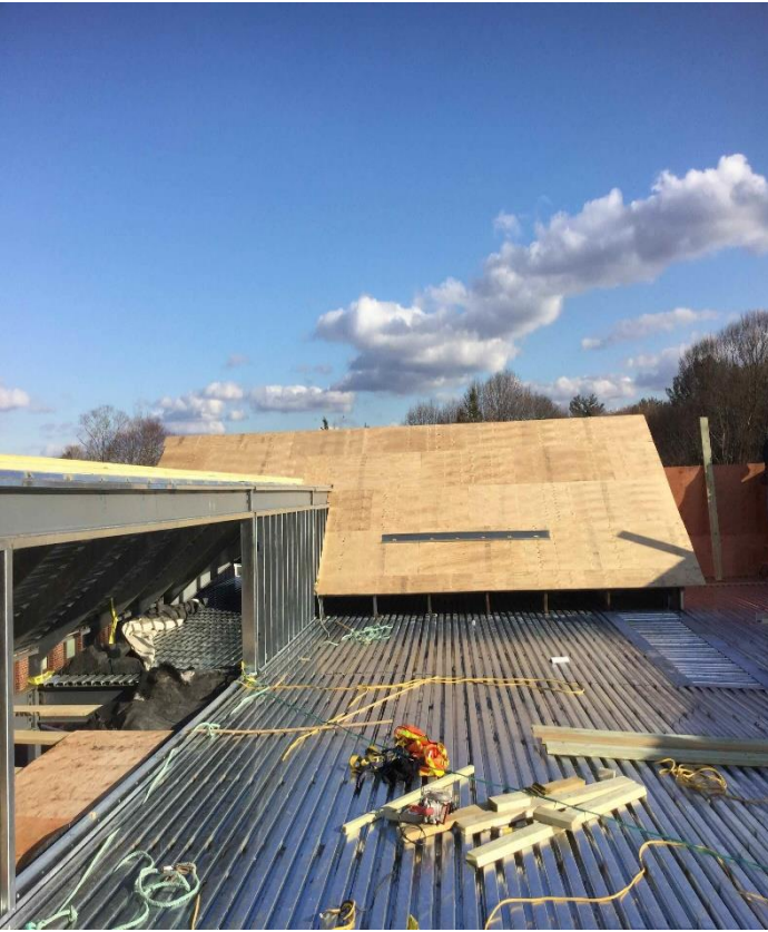
Signed Beam In Place