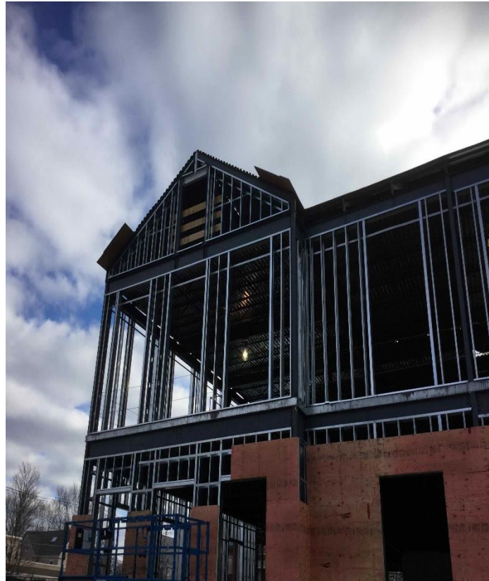
2 nd Floor Slab Placement