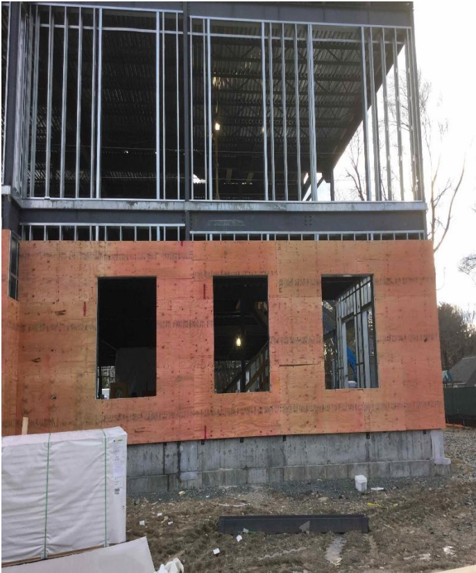
2 nd Floor Slab Placement