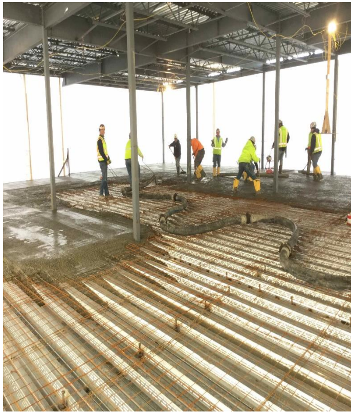
2 nd Floor Slab Placement