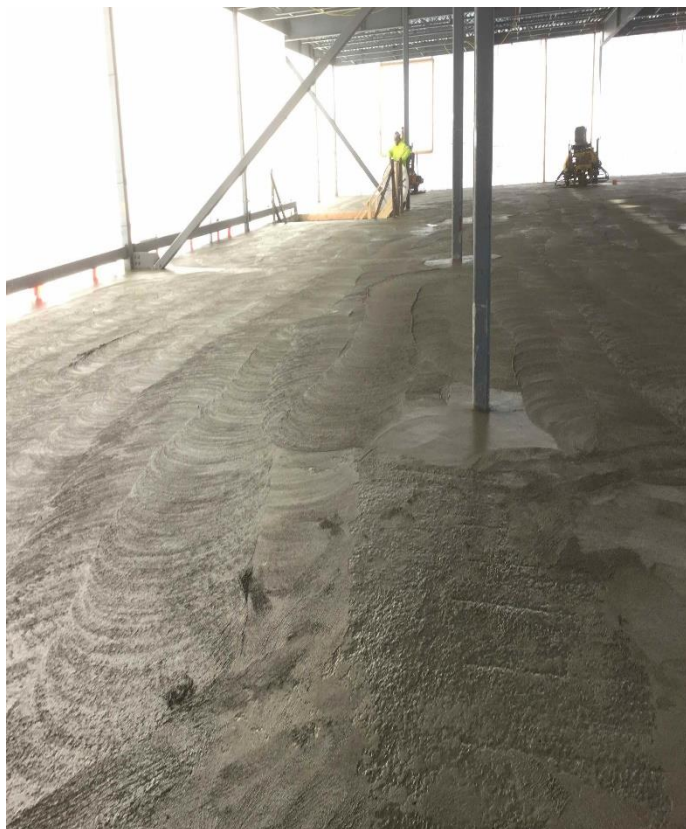
2 nd Floor Slab Finishing