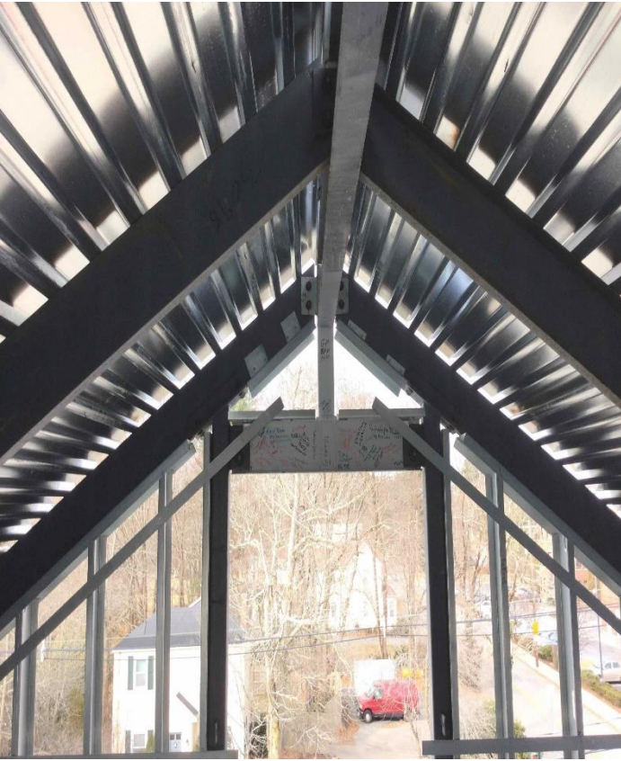
Signed Beam In Place