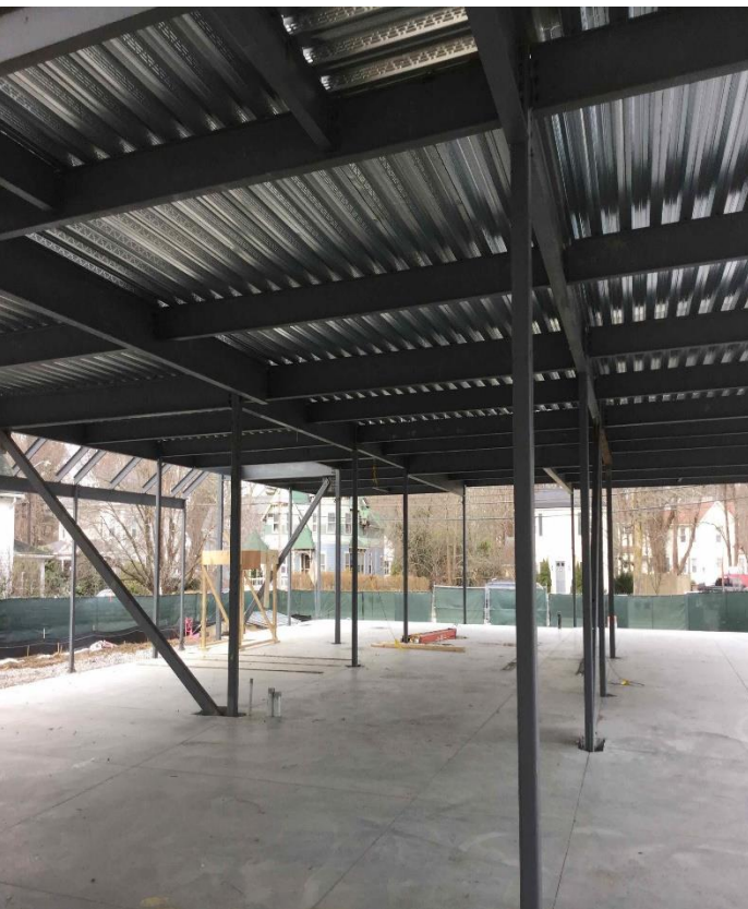
Underground Temp. Electric