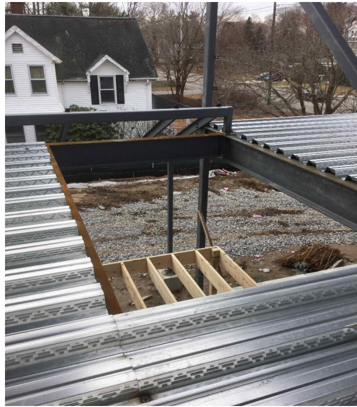
2 nd Floor Framing