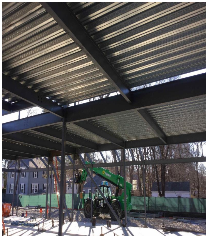
Frame and Deck