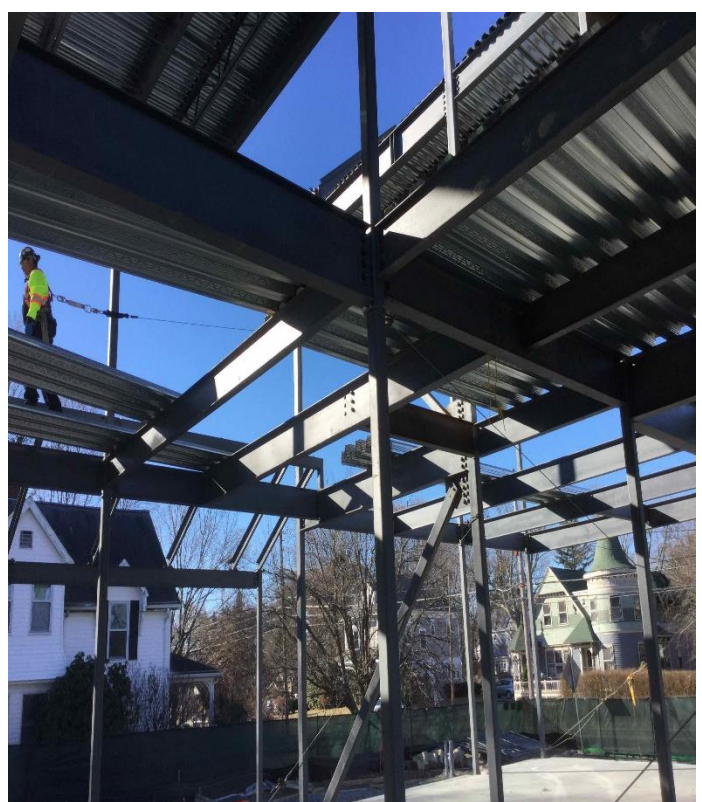
Joists and Deck