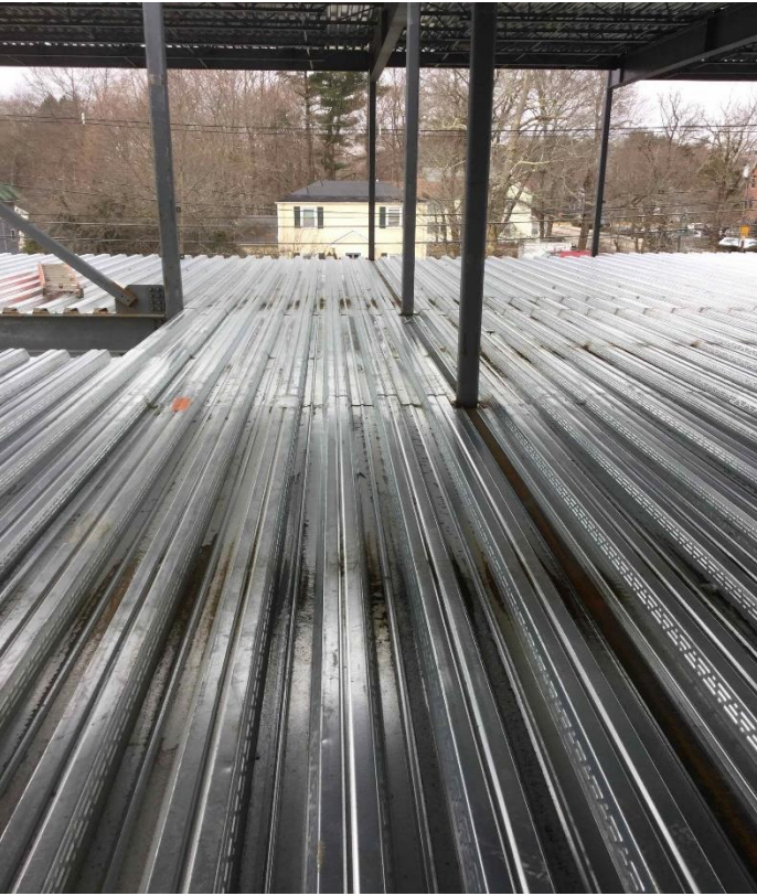
2 nd Floor Framing