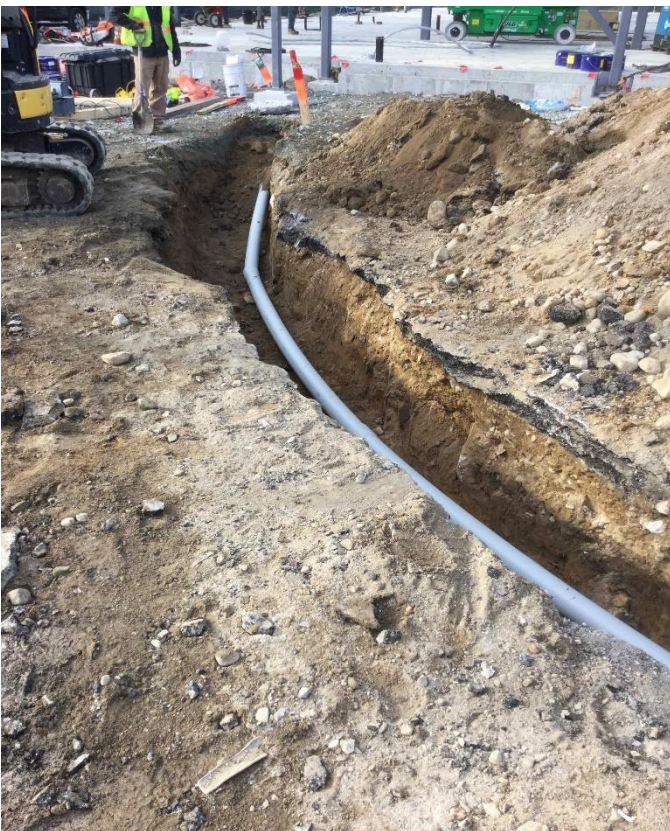
Underground Temp. Electric