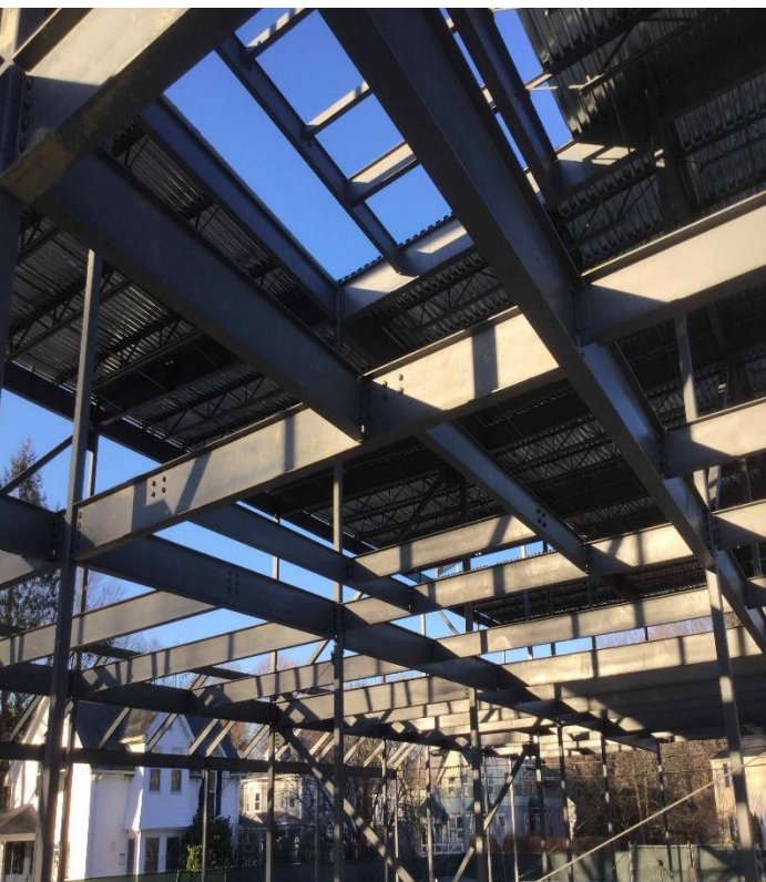
Frame and Deck