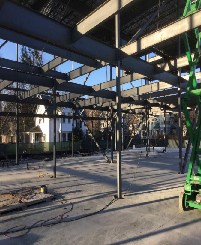
2 nd Floor Framing