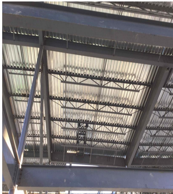
Joists and Deck