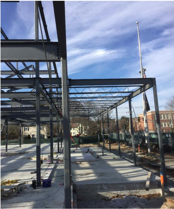
Column Erection – Seq. 1