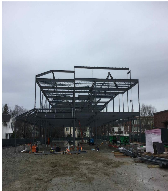
Sequence 3 with Joists