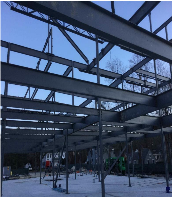
Sequence 2 Steel