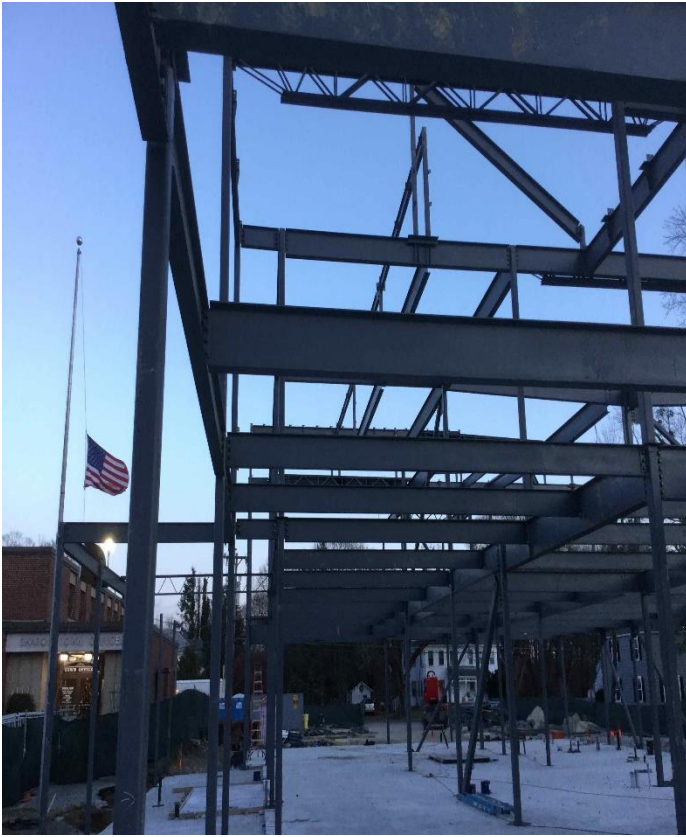
Steel Sequence 1