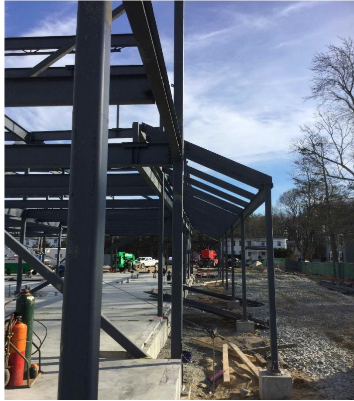
Sequence 1 Columns and Beams