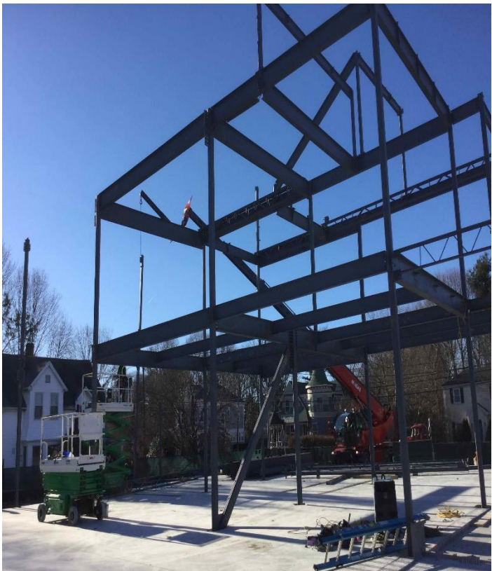
Sequence 1 Steel Erection