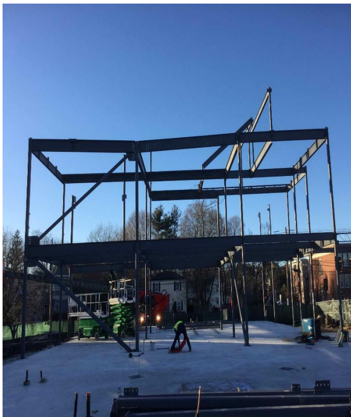
Sequence 1 Steel Erection