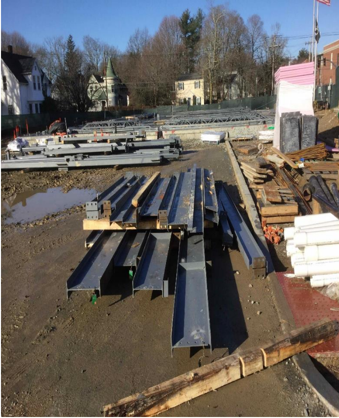
Shake Out Steel