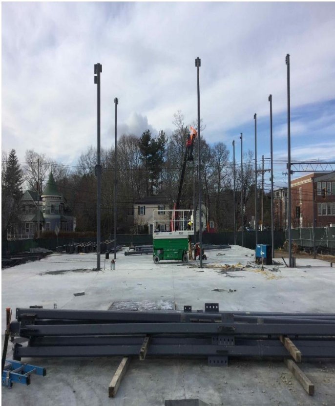
Column Erection – Seq. 1