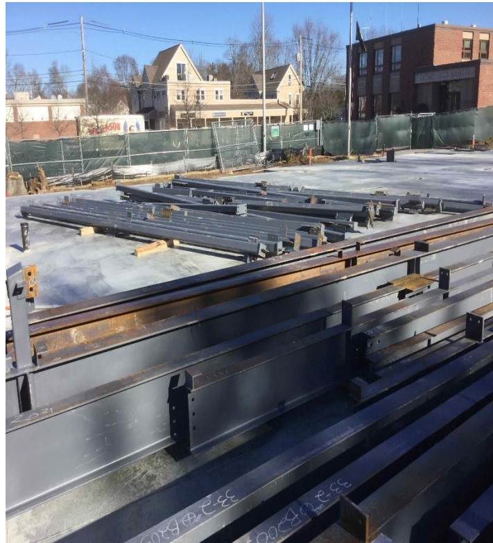
Shake Out Steel