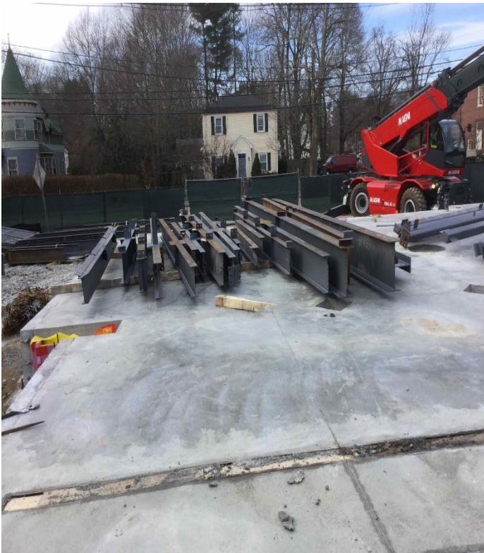
Shake Out Steel