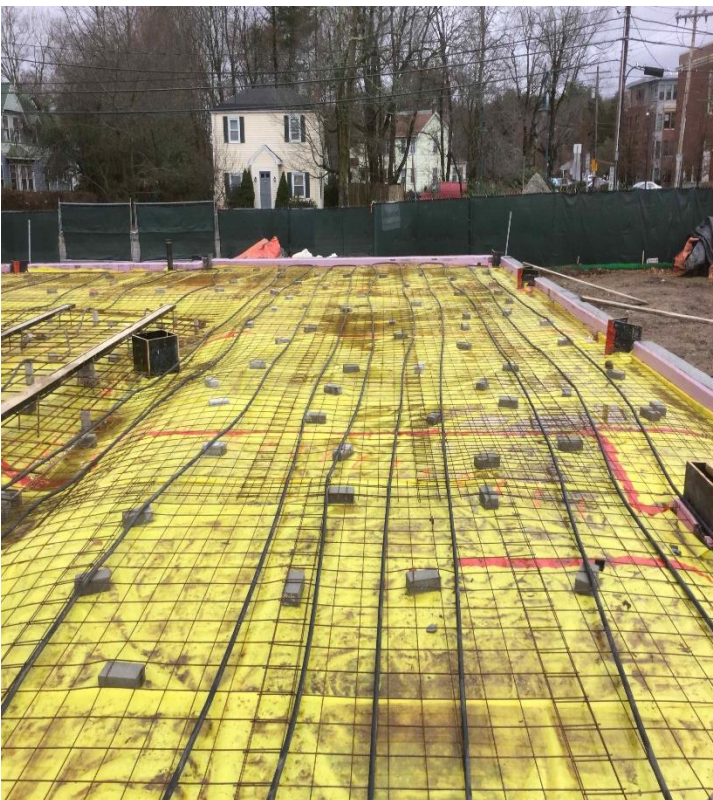
Vapor Barrier and Reinforcing