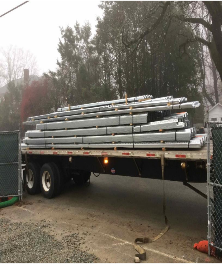
Steel Deck Delivery