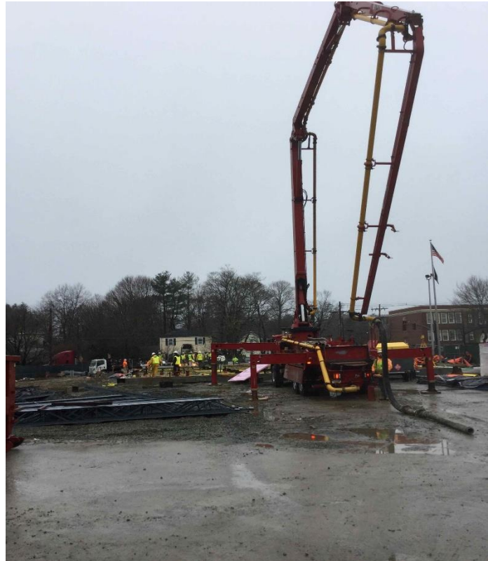
Concrete Pump Truck