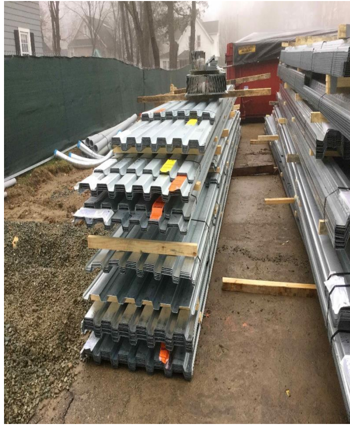
Steel Deck Unload