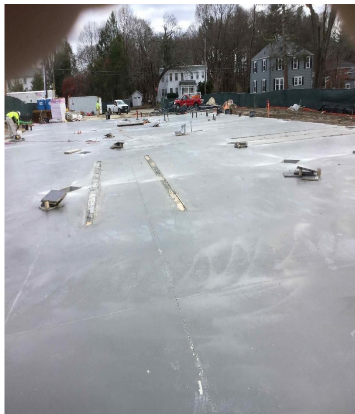
Apply Cure and Seal