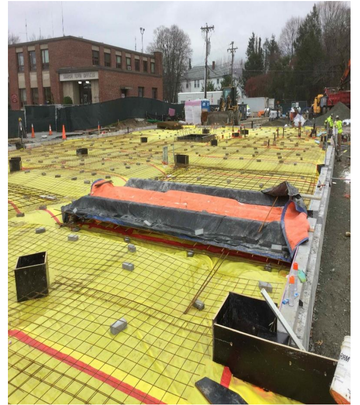
Vault Slab Protection