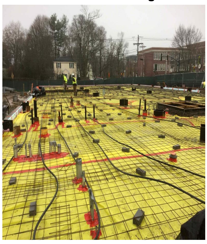
Ground Thaw Hosing Install