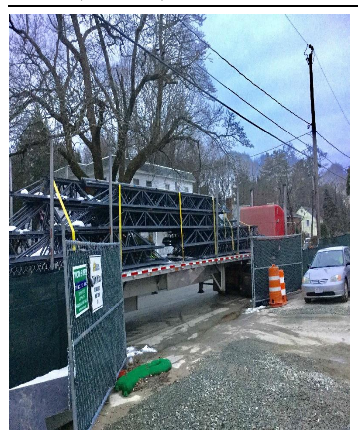
Steel Joist Delivery