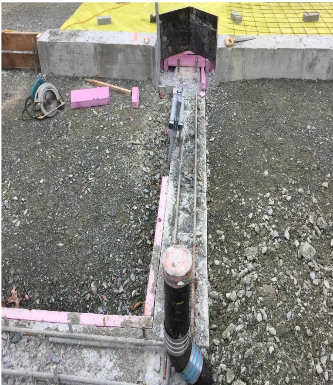
Roof Drain Piping