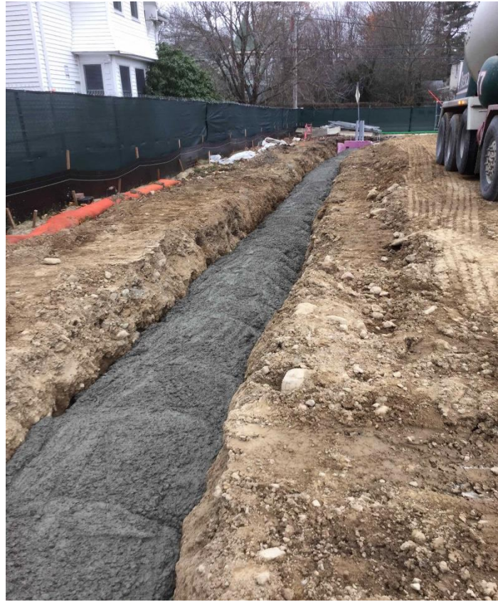
Electrical Duct Bank