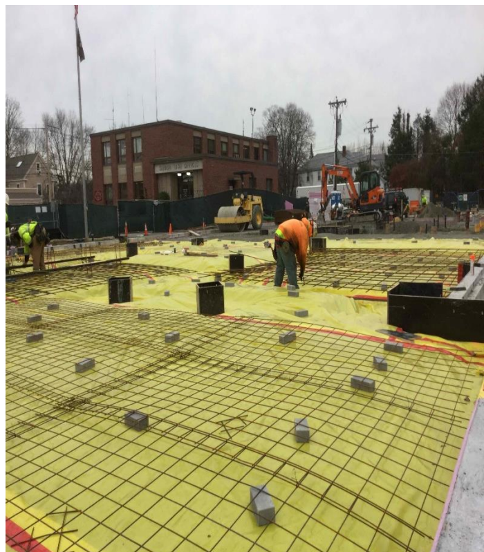
Slab Reinforcement Install