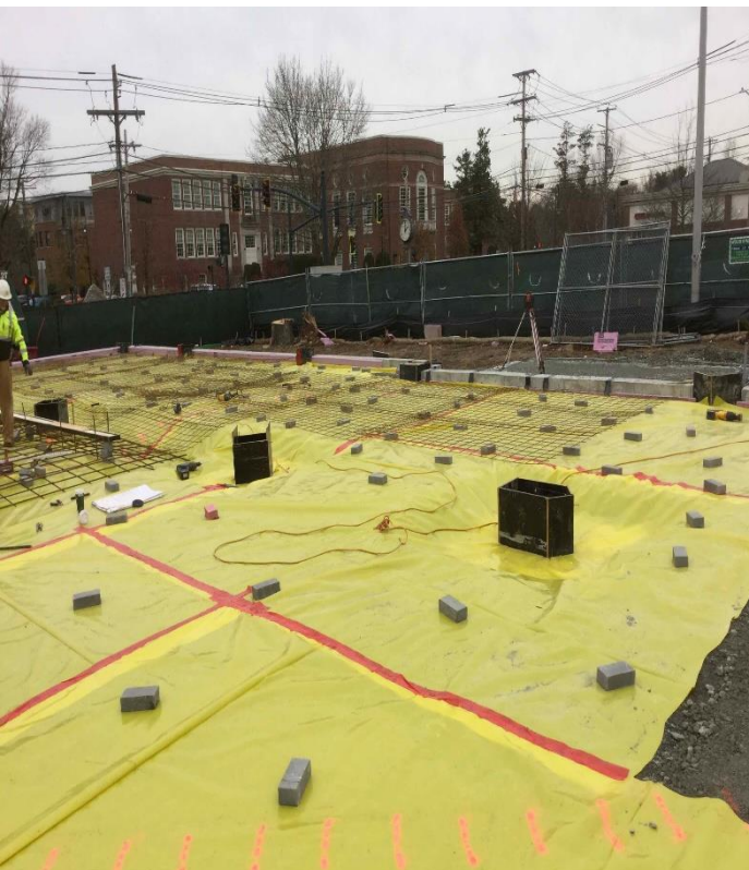
Vapor Barrier Install