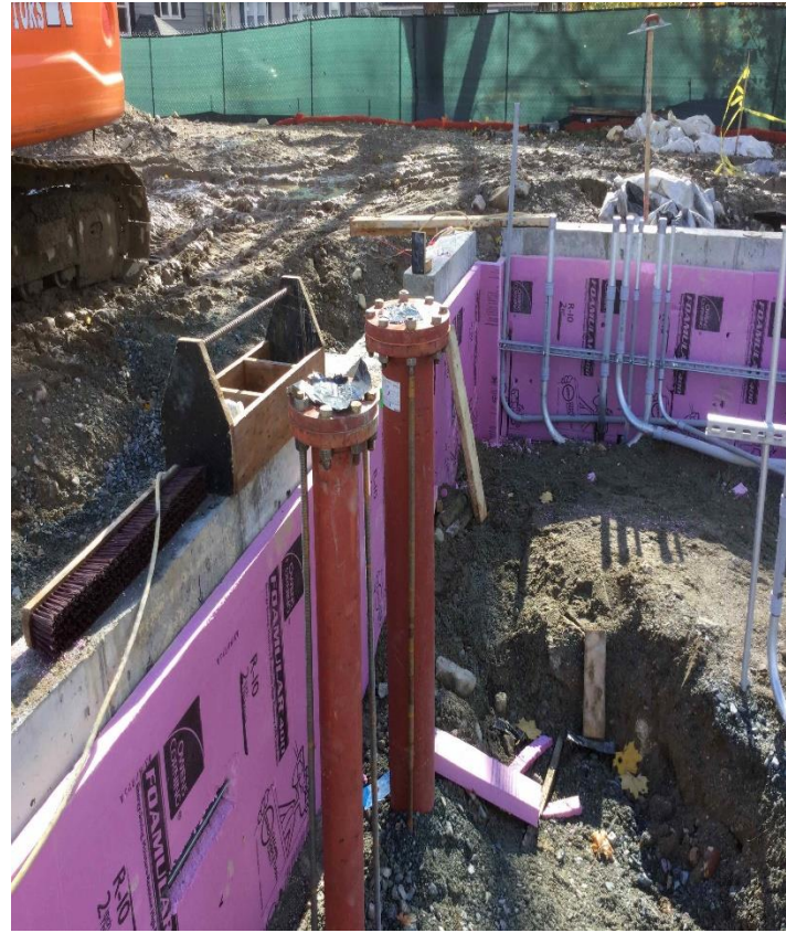
Domestic and Fire Piping