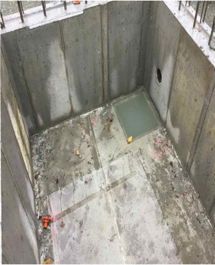
Elevator Pit and Sump Pit