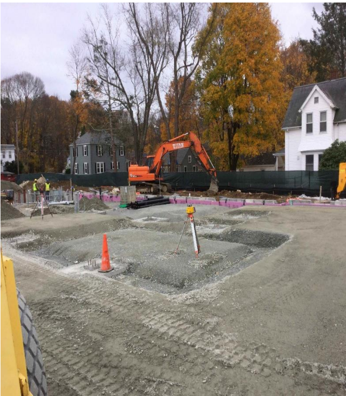
Building Slab Prep