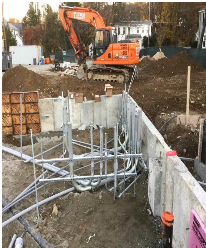
Main Electric Underground