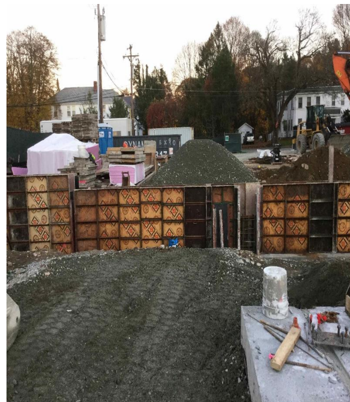
Foundation Wall Forms