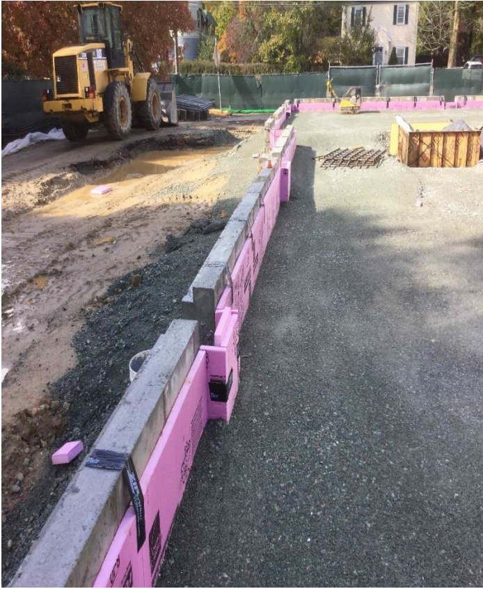
Foundation Wall Back Fill