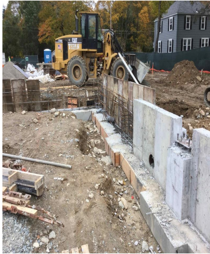
Prep For Foundation Forms