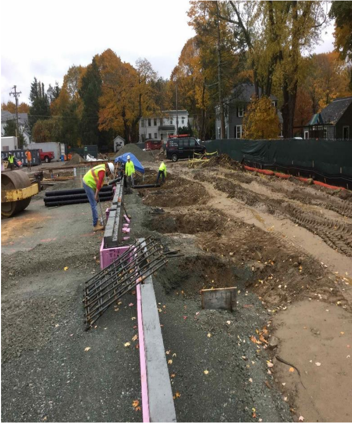
Prep for Concrete Slab