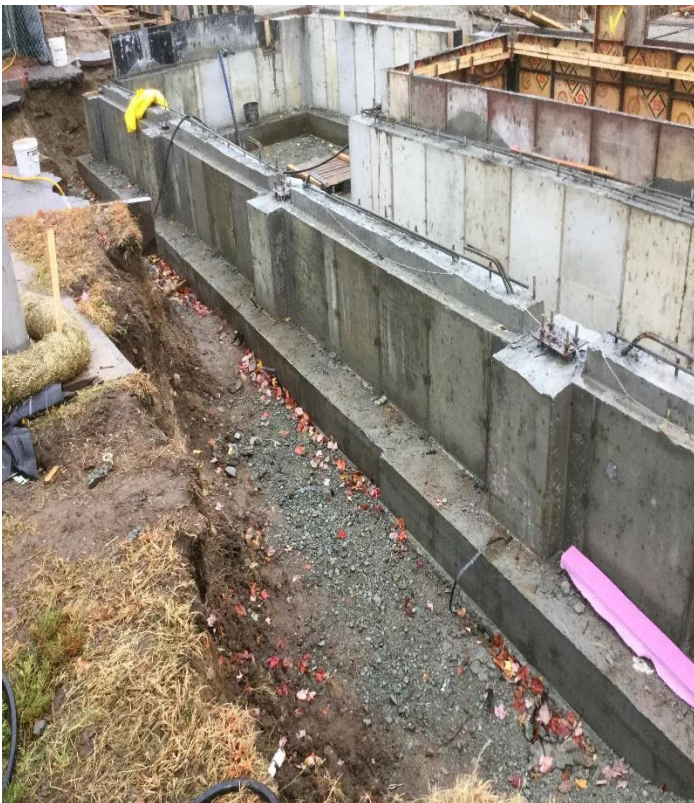
Entrance Foundation Wall