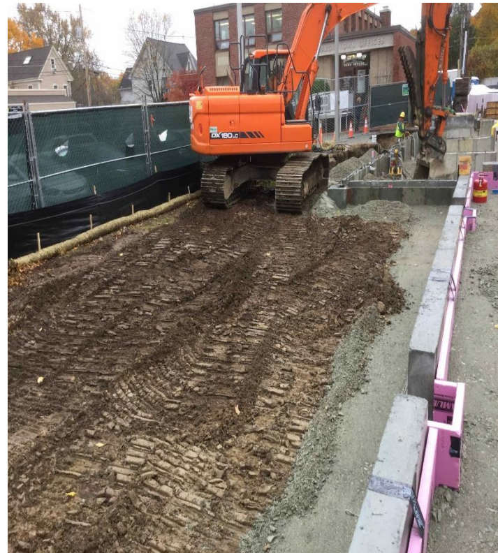
Back Fill Entrance Area