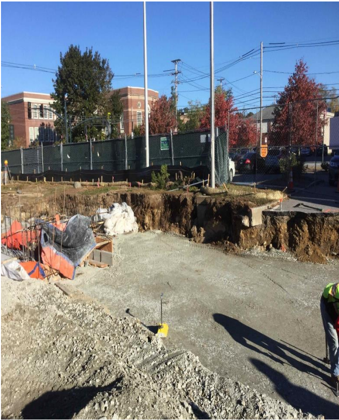
Sub Grade Testing