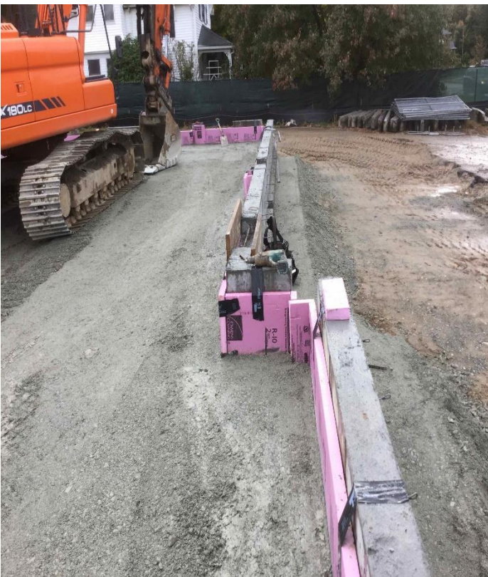
Back Fill Foundation Wall