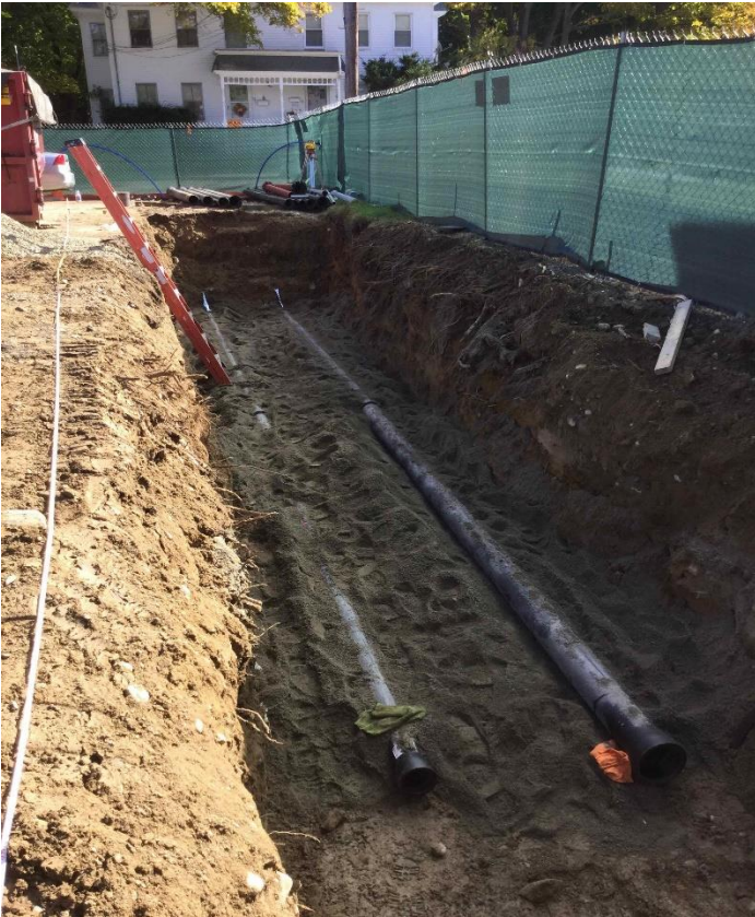
UG Water and Fire Protection