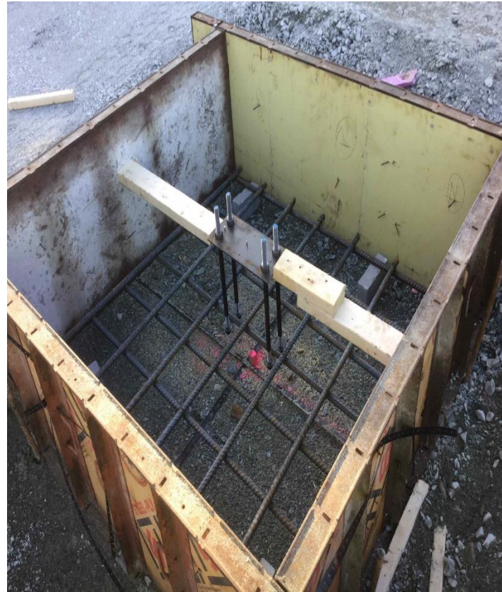
Interior Pier Rebar