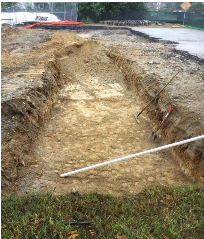
Excavate for Footings