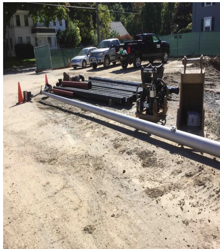
Light Pole for Salvage