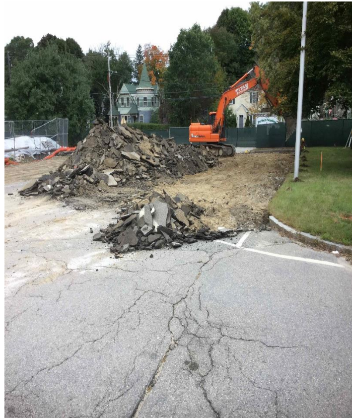
Strip Asphalt and Loam