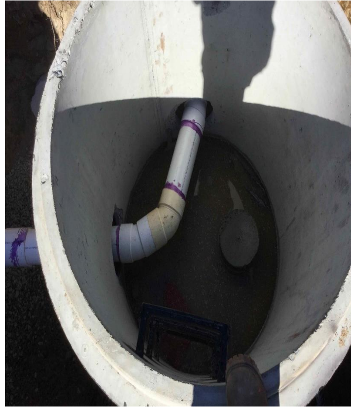
Temporary Sanitary Line