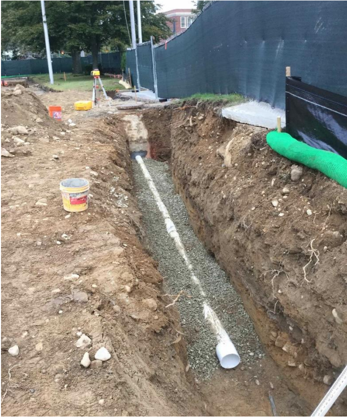
Temporary Sanitary Line