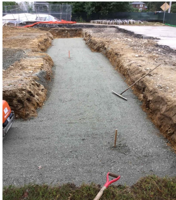
Structural Fill Subgrade