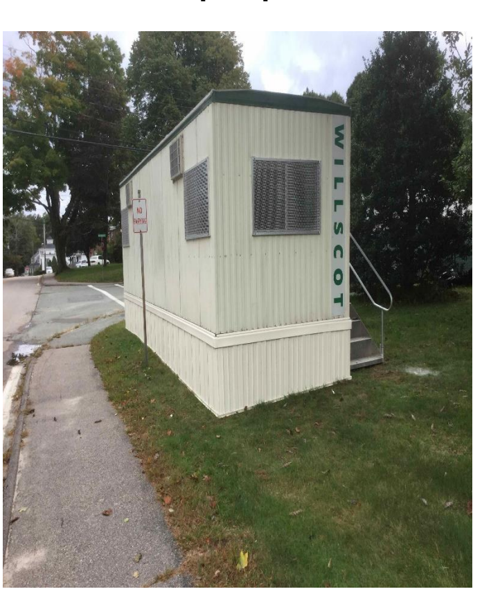
Daedalus Field Trailer