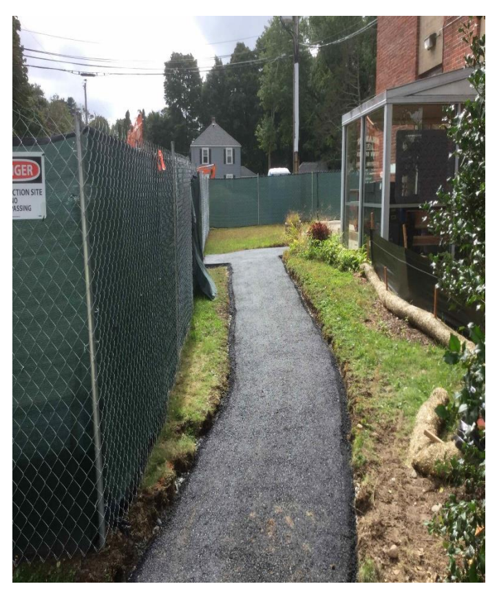
Temp. Asphalt Walkway