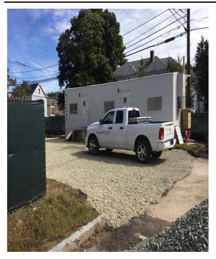
Trailer Laydown Area