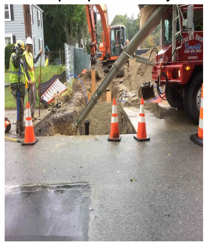
Backfill Street Trench