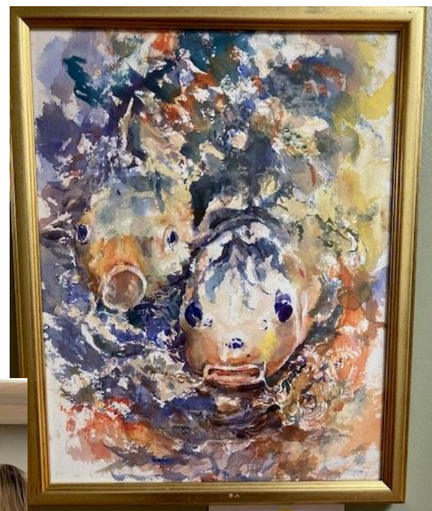
"Singing Koi" Water color - picture taken from the koi pond inside Sharon's landscape nursery on South Main St. The plants around the koi pond add to the stress free atmosphere of the swimming koi.