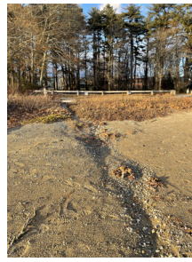
Memorial Beach 1/13/24