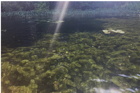
South Cove Fanwort before Diver-Assisted Suction Harvesting (DASH), 8/7/22

Source: MassDEP, Nine-Element Watershed-Based Plans Information . LMAC is working with consultants TRC and NepRWA, town departments, and many stakeholders to develop this plan. Email us to get involved!