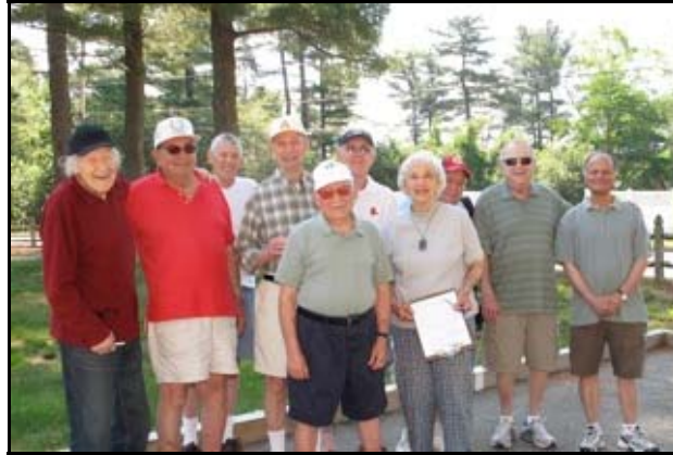
MEN'S CLUB MEMBERS AND FRIENDS KICK OFF BOCCE SEASON AT COMMUNITY CENTER